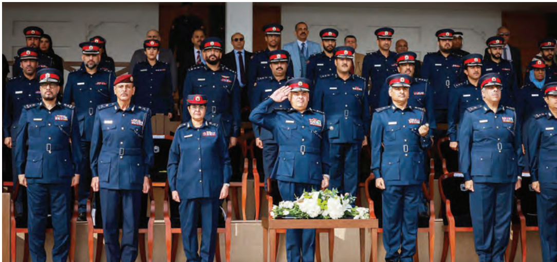
Lt-General Tariq Al Hassan salutes the graduates

He noted the ongoing efforts to enhance the policing system, reinforce community partnership and strengthen engagement with the public. The Chief praised the comprehensive development programmes implemented by the Royal Academy of Police, within the framework of skills development in accordance with the latest international standards applied in academic and training curricula, in line with operation-