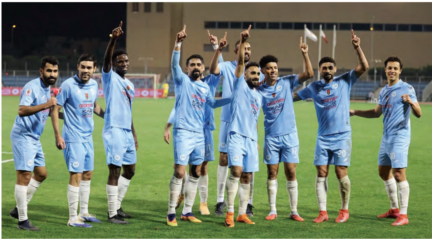
Joy for Riffa players as they keep the pressure on the league leaders