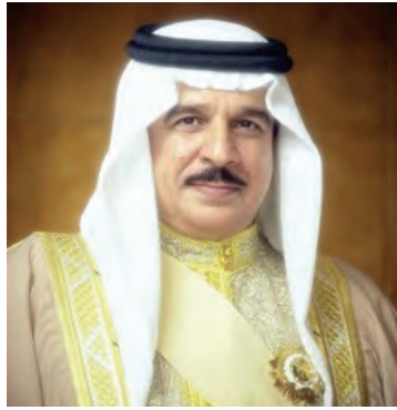
HM the King

provisions will come into force from the first day of the month following twelve months from the date of its publication in the Official Gazette. Before that, the minister concerned with commerce, or another minister assigned by decree, is required to issue the executive regulations needed to implement the law, after Cabinet approval, within eight months from the day following publication. For matters related to the right of security that are not