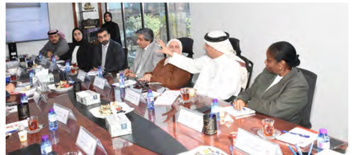
Eskan Bank representatives with Capital Trustees Board members during a meeting