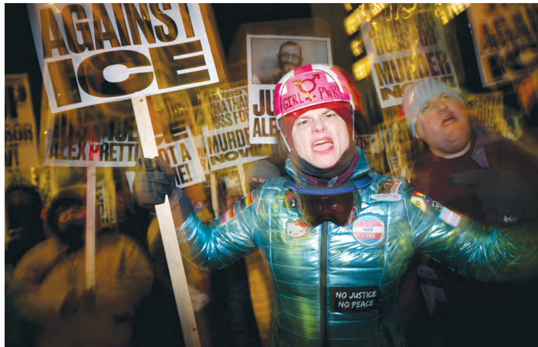
A group of anti-US Immigration and Customs Enforcement (ICE) protesters hold signs and shout slogans in downtown Minneapolis, Minnesota