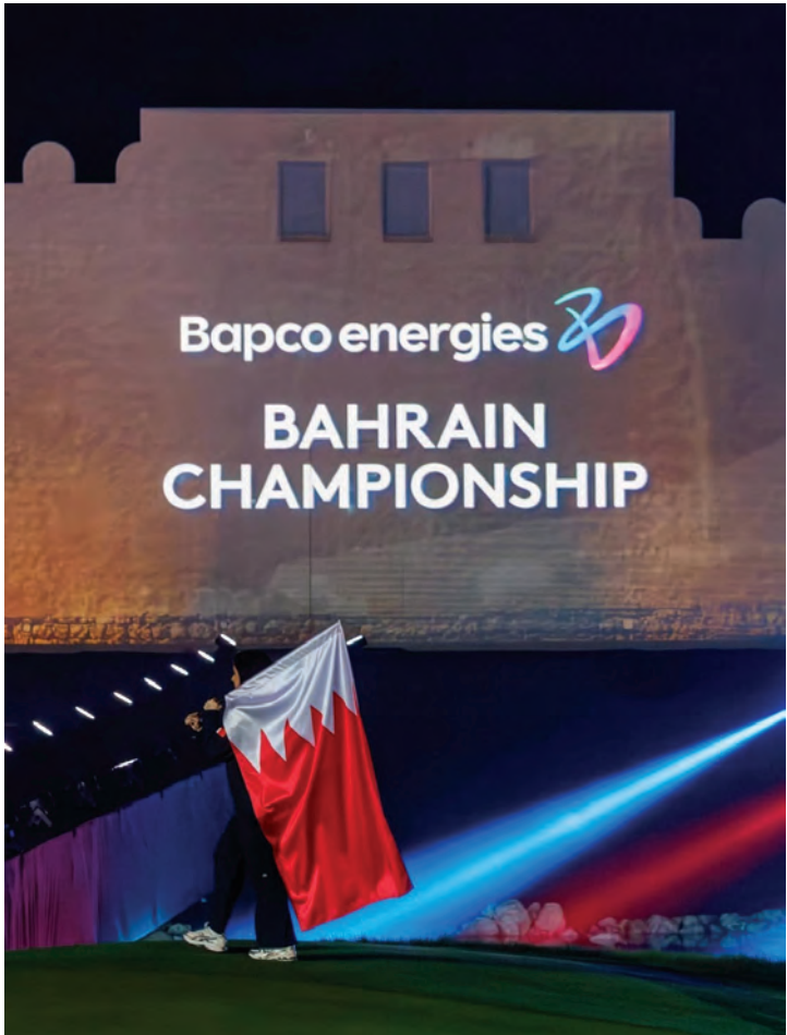
Bahrain's flag is paraded during Tuesday's opening ceremony at Royal Golf Club

The Royal Golf Club is expected to test every aspect of a player's game, rewarding accuracy and patience over four competitive rounds. With conditions familiar to many in the field, margins are likely to be tight as the tournament unfolds.