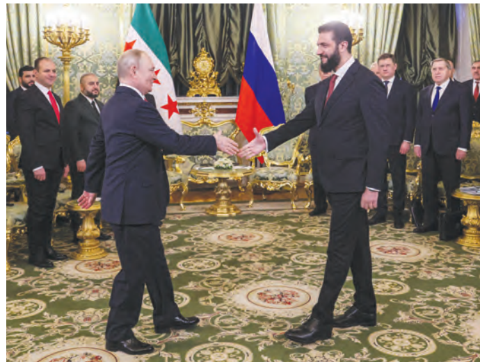
Russian President Vladimir Putin welcomes Syria's President Ahmed al-Sharaa during a meeting at the Kremlin in Moscow

"Much has been accomplished in terms of restoring our interstate relations," Putin said in a televised meeting with Sharaa. "We have closely mon-