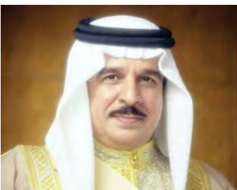
HM the King

Existing decisions related to private educational institutions will remain in effect, provided