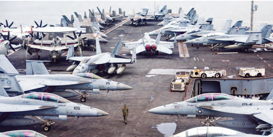
A US Navy officer walks past fighter jets sitting on the flight deck of the Nimitz-class aircraft carrier USS Abraham Lincoln during a media tour in Port Klang, on the outskirts of Kuala Lumpur,

Analysts say options include strikes on military facilities or targeted hits against the leadership under Ayatollah Ali Khamenei, in a full-scale bid to bring down the system that has ruled Iran since the 1979 Islamic revolution.