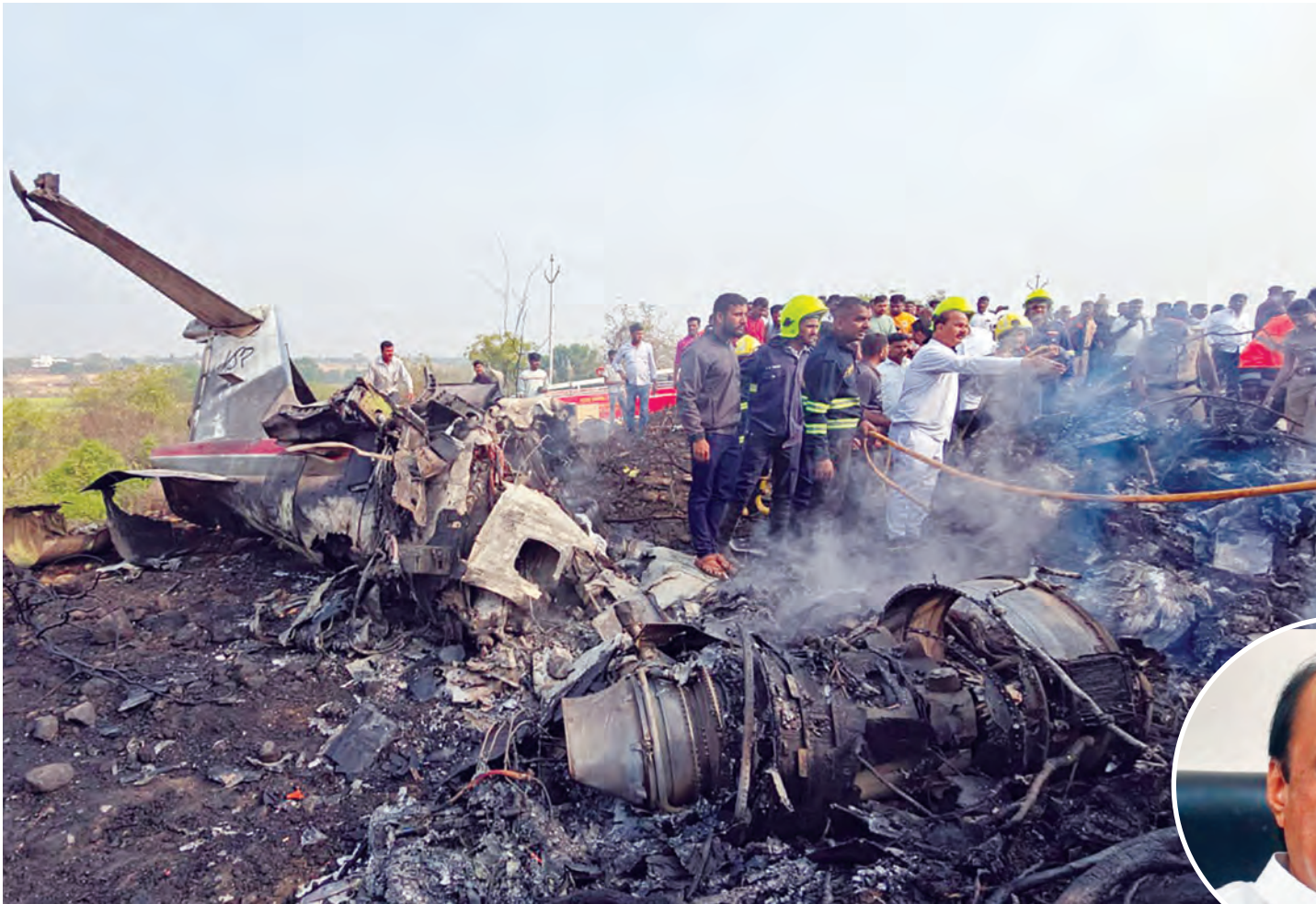
Rescue personnel and onlookers gather around the wreckage of the aircraft carrying Maharashtra's deputy chief minister, Ajit Pawar, after it crashed in an open field while landing near Baramati airport in India's Maharashtra state

The 66-year-old, a key political figure in Maharashtra which is home to India's financial hub Mumbai, was travelling in a Bombardier Learjet 45 aircraft, operated by private firm VSR Aviation.