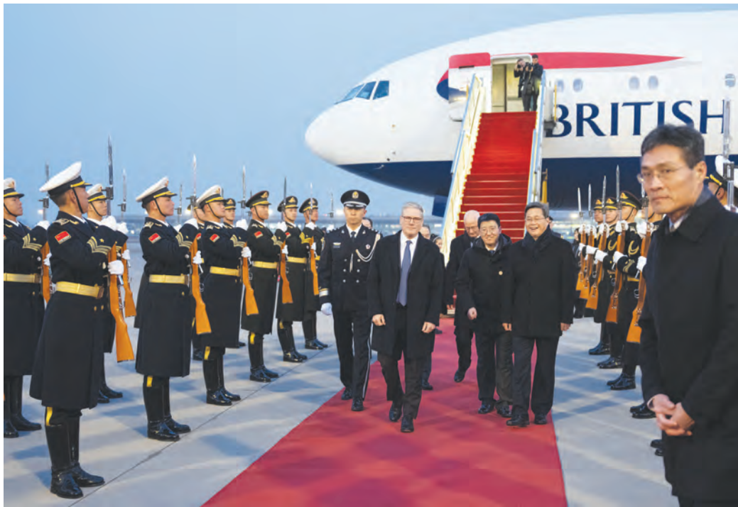
Britain's Prime Minister Keir Starmer is welcomed upon his arrival at an airport in Beijing

British PM will later make a brief stop in Japan