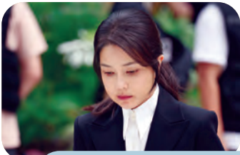
South Korea's ex-first lady jailed for 20 months for taking bribes