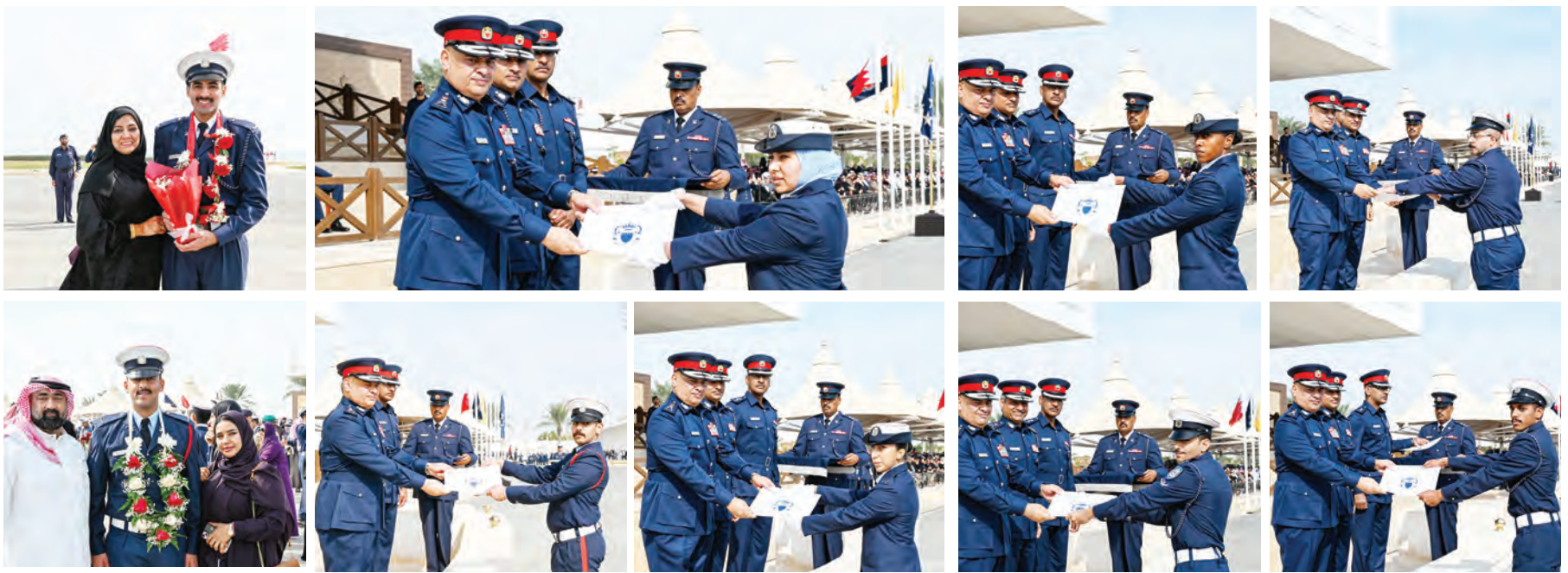
The graduates who completed the integrated academic and practical training programmes

al developments and modern technologies in police work. He noted that the 878 new police personnel who graduated today were prepared in accordance with the latest scientific and training systems, taking into account contemporary concepts and challenges, modern approaches to combating organised crime, and adherence to the rules and procedures of police work.