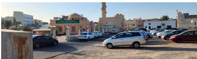
Cars compete for space across various areas in Sitra

The Capital Municipal Council reviewed in its tenth session, a recommendation concerning the acquisition of three privately owned properties in the External Area of Sitra for conversion into public parking facilities serving surrounding religious and community sites.