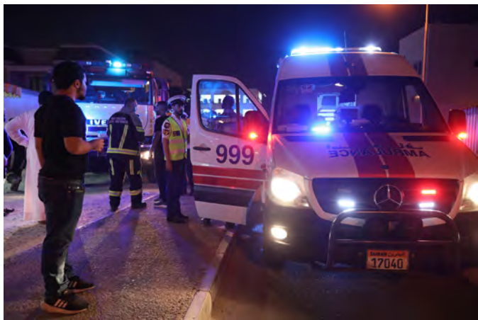
Ambulances on standby for emergency response