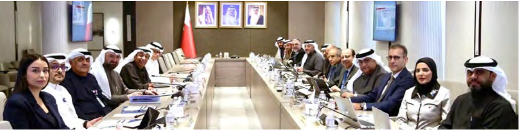
Financial and Economic Affairs Committee

The committee said its work follows a set process laid down