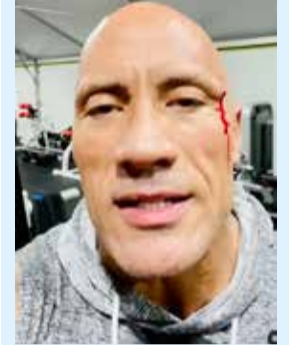
Fox | Los Angeles

Not even a face injury can stop Dwayne "The Rock" Johnson. The 48-year-old actor and fitness enthusiast hurt his face in a recent workout, drawing blood while using heavy chains to stay in shape. Johnson shared a video on Instagram on Monday to show off the injury. "Alright, look. Sometimes, well oftentimes, things get intense here in the iron paradise, but we ain't playing tiddly-winks and we ain't reciting nursery rhymes," said the star in the video. "You get lumped up every once in a while and things happen." A stream of blood ran down the "Moana" star's face next to one of his eyes. In the video, he used a finger to wipe away some of the blood before briefly sticking the same finger in his mouth and licking it. "That's good. That's real good," he said after cleaning his finger. "Back to work." In the caption of the post, Johnson revealed how he hurt himself. "Threw around my 50lb chains for a drop set - I got lumped up and need stitches," he wrote. "Taste your blood, keep training and stitch up later - rules of the house. And I can confirm my blood tastes like Teremana, calluses and BlaMoan (black and samoan) Hot Sauce." The star concluded by wishing a "productive week" upon his followers.