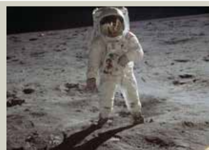
When the Apollo astronauts first returned from the Moon in 1969, it was thought to be completely dry.

As a comparison, the Sahara desert has 100 times the amount of water than what SOFIA detected in the lunar soil. Despite the small amounts, the discovery raises new questions about how water is created and how it persists on the harsh, airless lunar surface.