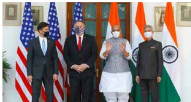
US Defence Secretary Mark Esper, Secretary of State Mike Pompeo, Defence Minister Rajnath Singh and India's External Affairs Minister Subrahmanyam Jaishankar during a photo call

It will also allow the United States to provide the latest navigational technology on