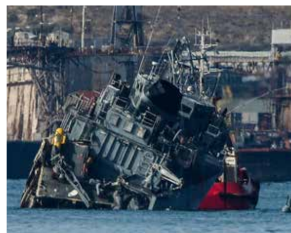
AFP | Athens

Two crew members of a Greek minesweeper were slightly hurt Tuesday after it collided with a Portuguese container ship off Piraeus, the port next to Athens, the navy said.