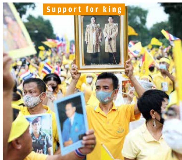
Support for king

This time round, they have taken a different approach and adopted Borat's catchphrase "Very Nice!" to try to promote tourism in the vast Central Asian country.