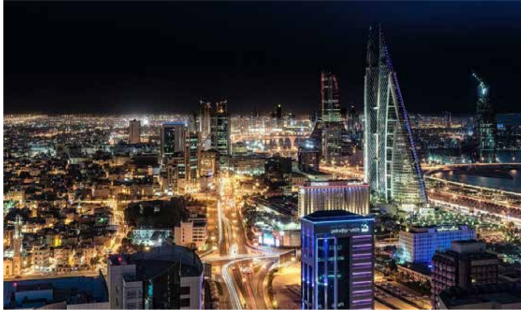
Bahrain 'least exposed' to risk of money laundering in the Arab world

Among the riskiest countries in the Middle East include Tu-