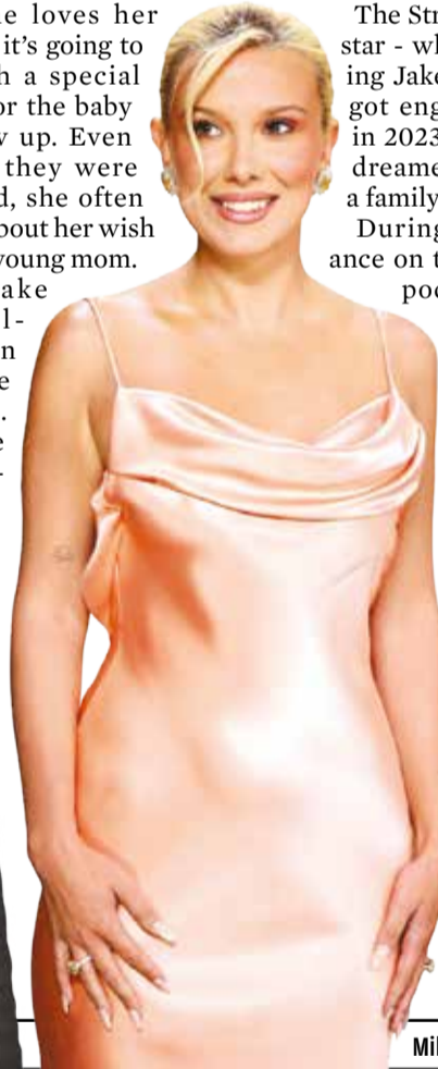
Millie Bobby Brown