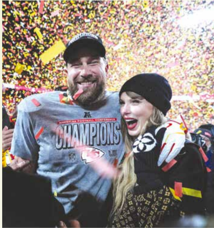
Taylor Swift and Travis Kelce

US President Donald Trump was among the first to publicly congratulate the star couple, despite earlier bad blood with Swift over her endorsement of his opponent Kamala Harris in