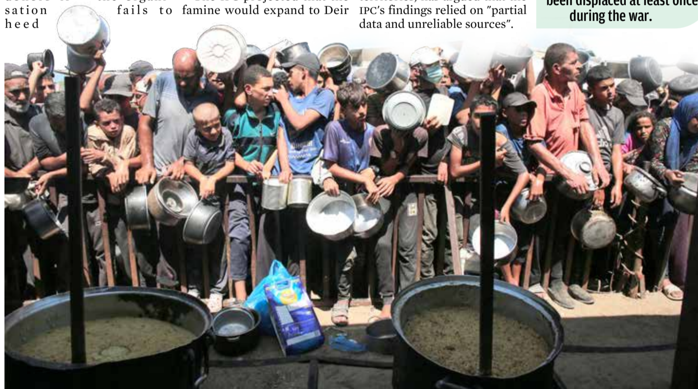
Palestinians wait to receive food portions from a charity kitchen in Khan Yunis in the southern Gaza Strip