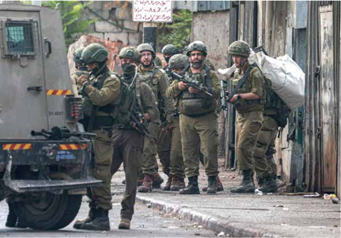
Israeli troops deploy during a raid in Nablus city in the occupied West Bank

"Nine wanted suspects accused of involvement in terror activity were arrested and taken, together with the seized evidence, for investigation," it added.