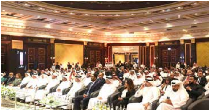
Crowd in attendance at the press conference at the Ritz-Carlton Hotel