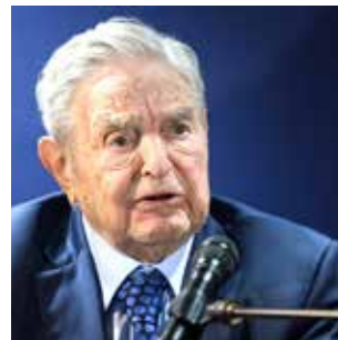
Hungarian-born US investor and philanthropist George Soros Washington, United States

US President Donald Trump called yesterday for billionaire George Soros and his son to face criminal charges over unfounded claims that their family, a favorite right-wing target, is behind "violent protests" around the country.