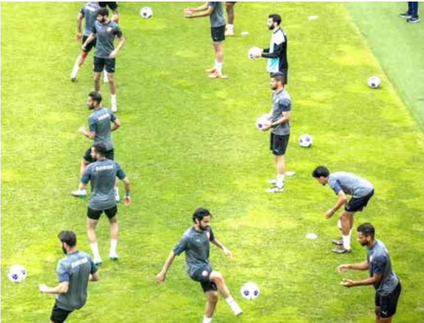
Bahrain players in training ahead of their upcoming friendlies

Talajic names 29-man squad for international FIFA window