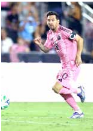
Lionel Messi in action (file photo)