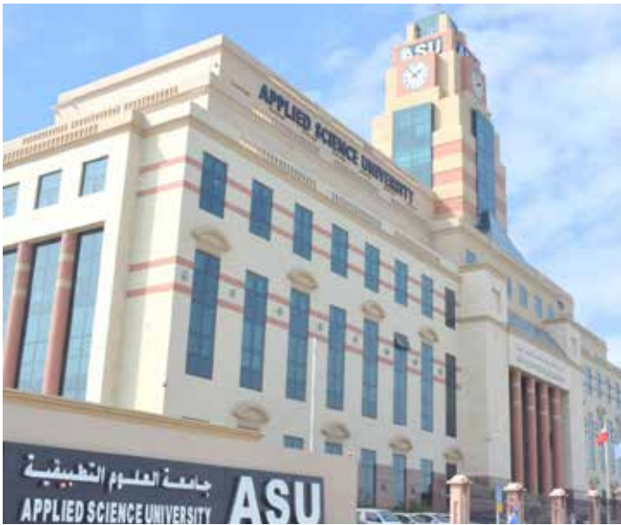
Applied Science University (ASU)

For diploma holders in Bahrain and the wider region, a long-standing barrier to higher education has just been broken. Applied Science University (ASU) has unveiled the Kingdom’s first accredited Bridging Programme by a private university, giving students a fast-track route to a bachelor’s degree in as little as two years. Breaking the barrier Until now, diploma graduates often faced limited progression options. ASU’s new pathway changes that equation, offering officially recognised bridging into disciplines like Computer Science and into dual-award British engineering degrees delivered with London South Bank