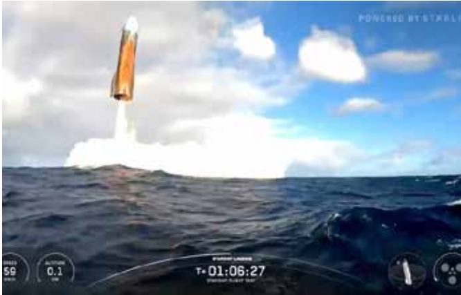
The upper stage of SpaceX's Starship rocket splashing down in the Indian Ocean after lifting off from Starbase, Texas