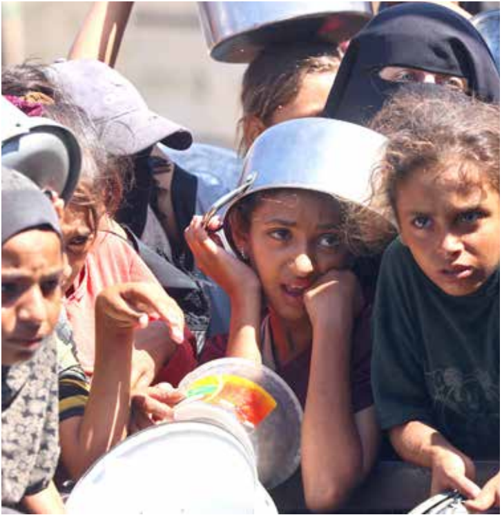
Palestinian women and children wait to receive food portions from a charity kitchen in Khan Yunis in the southern Gaza Strip

She insisted aid groups have been warning loudly that famine was coming as Israel prevented food and other essentials from