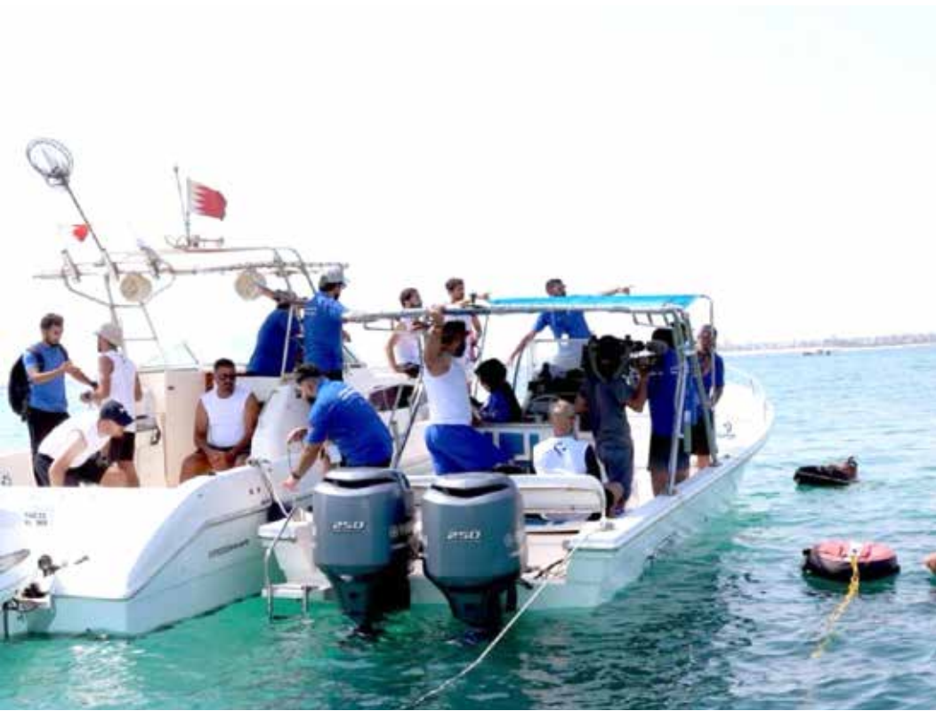
Participants prepare for the upcoming breath-holding competition off Amwaj Islands

The organising committee of the 8th Nasser bin Hamad Marine Heritage Season is set to host the Shaikh Khalid bin Hamad Al Khalifa Breath-Holding Contest on Friday in the waters near Amwaj Islands Marina. Fifty participants will compete to stay submerged at a depth of two metres, with the ten longest performers declared winners.