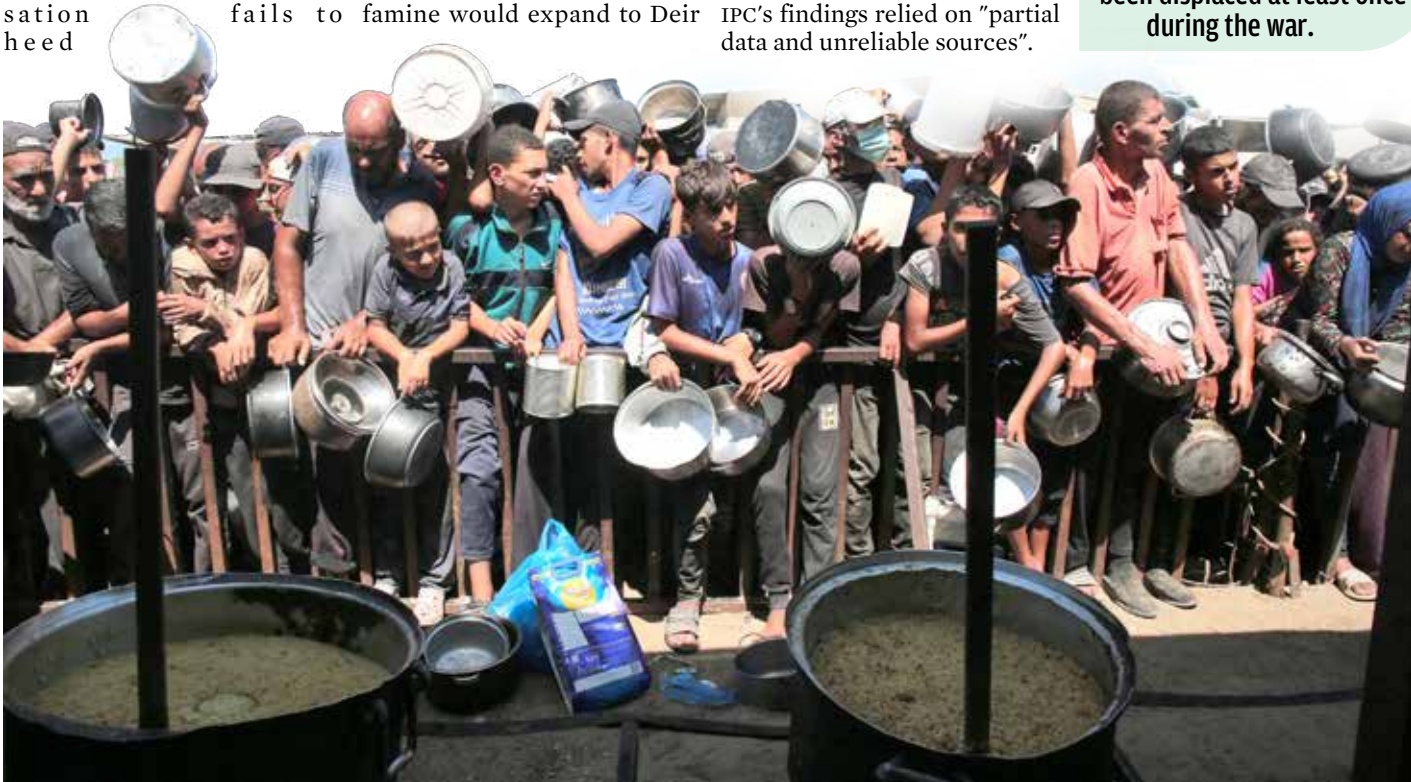
Palestinians wait to receive food portions from a charity kitchen in Khan Yunis in the southern Gaza Strip

The vast majority of the Gaza Strip's population of more than two million people have been displaced at least once during the war.