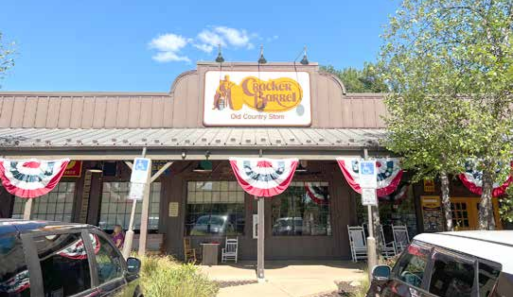
Outside view of the Cracker Barrel Old Country Store in Mount Arlington, New Jersey Washington, United States

US restaurant chain Cracker Barrel announced Tuesday it was reverting to its old logo after its rebrand sparked a furious, culture war-fueled backlash, including criticism from President Donald Trump. The folksy, homestyle US chain saw tens of millions of dollars wiped off its share price since it unveiled a new look last week that right-wingers criticized as “woke.” The announcement that Cracker Barrel was going back to its old logo -- the image of an old man sitting on a chair and leaning on a barrel -- came just hours after Trump weighed in on the controversy. “Cracker Barrel should go back to the old logo, admit a