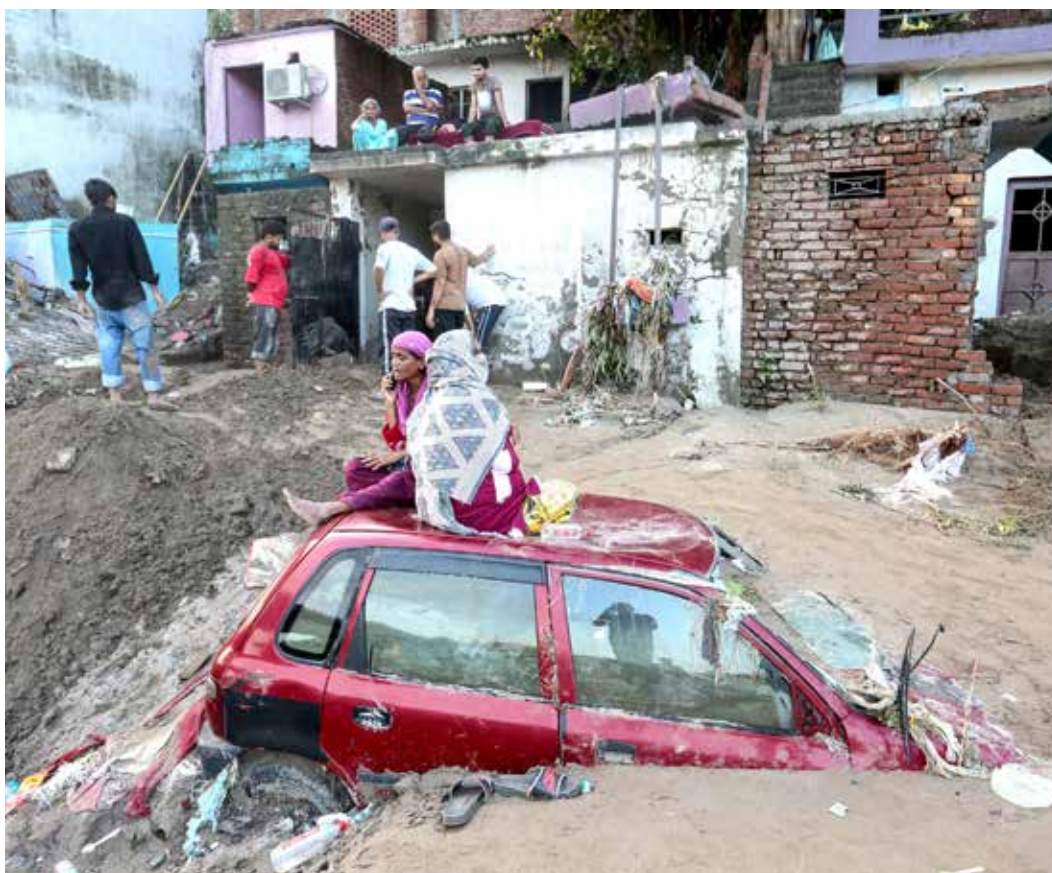
Women sit over a car buried under mud and debris along the banks

Floods and landslides are common during the June-September monsoon season, but experts say climate change,