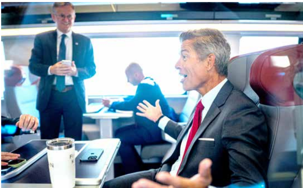
U.S. Transportation Secretary Sean Duffy (C) sits onboard a NextGen Amtrak Acela train for a trip to Boston following a news conference on the upgraded train's first day of service along the Northeast Corridor

The Trump administration said yesterday it will exert more control over Washington by taking over management of Union Station, the US capital's rail hub. The announcement by Transportation Secretary Sean Duffy -- he said the station had become "dilapidated" -- came as the administration has already deployed thousands of federal agents and National Guard troops to the streets of Washington to battle what it calls a surge in violent crime. President Donald Trump "wants Union Station to be beautiful again. He wants transit to be safe again. He wants our nation's capital to be great again," Duffy told a press conference at the stately building a stone's throw from the US Capitol. Union Station, which opened in 1907, has been owned by the government since the 1980s but its operational control is held by the national railroad company Amtrak. Now the Trump administration is taking over. Since the 1980s "Washington Union Station has become dilapidated. It is known more as a