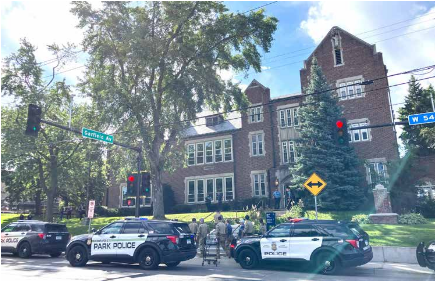
Police and first responders work at the scene of a shooting near Annunciation Church and Catholic School in Minneapolis, Minnesota

Minnesota Governor Tim Walz wrote on X earlier that he was "praying for our kids and teachers whose first week of school was marred by this horrific act of violence." Live video footage showed panicked parents retrieving their young children and fleeing, amid a major emergency response.