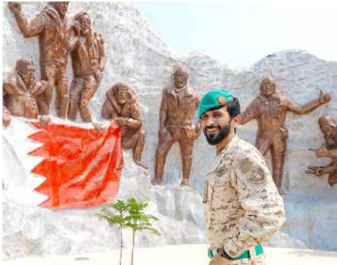
Lieutenant General His Highness Shaikh Nasser bin Hamad Al Khalifa, National Security Advisor and Royal Guard Commander, attended the inauguration of the Al Roudha Camp Roundabout. At the centre of the roundabout stands a memorial dedicated to the achievement of the Royal Guard team that scaled Mount Everest, with the climbers themselves attending the opening ceremony. HH Shaikh Nasser emphasised that the memorial stands as a testament to the courage and determination of the Royal Guard personnel who raised the Bahraini flag on the world's highest peak. His Highness said it reflects the spirit of challenge and perseverance embraced by the people of Bahrain.