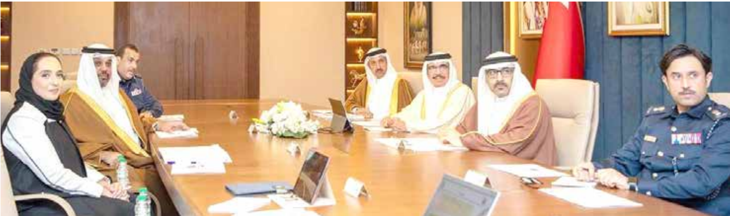
H.E. General Shaikh Rashid bin Abdullah Al Khalifa chairs the Traffic Council meeting attended by senior government officials

The new decree-law, issued on the directives of His Majesty King Hamad bin Isa Al Khalifa and backed by the government