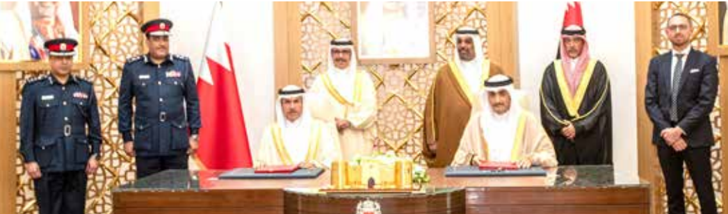
H.E. Shaikh Hisham bin Abdulrahman Al Khalifa and H.E. Shaikh Abdulla bin Khalifa Al Khalifa sign the agreement, in the presence of H.E. Lieutenant-General Shaikh Rashid bin Abdullah Al Khalifa and H.E. Shaikh Salman bin Khalifa Al Khalifa

Officials said the technology goes beyond technological surveillance, using AI tools that can self-learn, evolve and de-