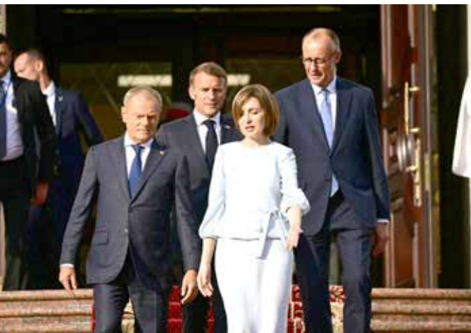
From left: Polish Prime Minister Donald Tusk, French President Emmanuel Macron, Moldova's President Maia Sandu and German Chancellor Friedrich Merz walk down the steps following a press conference