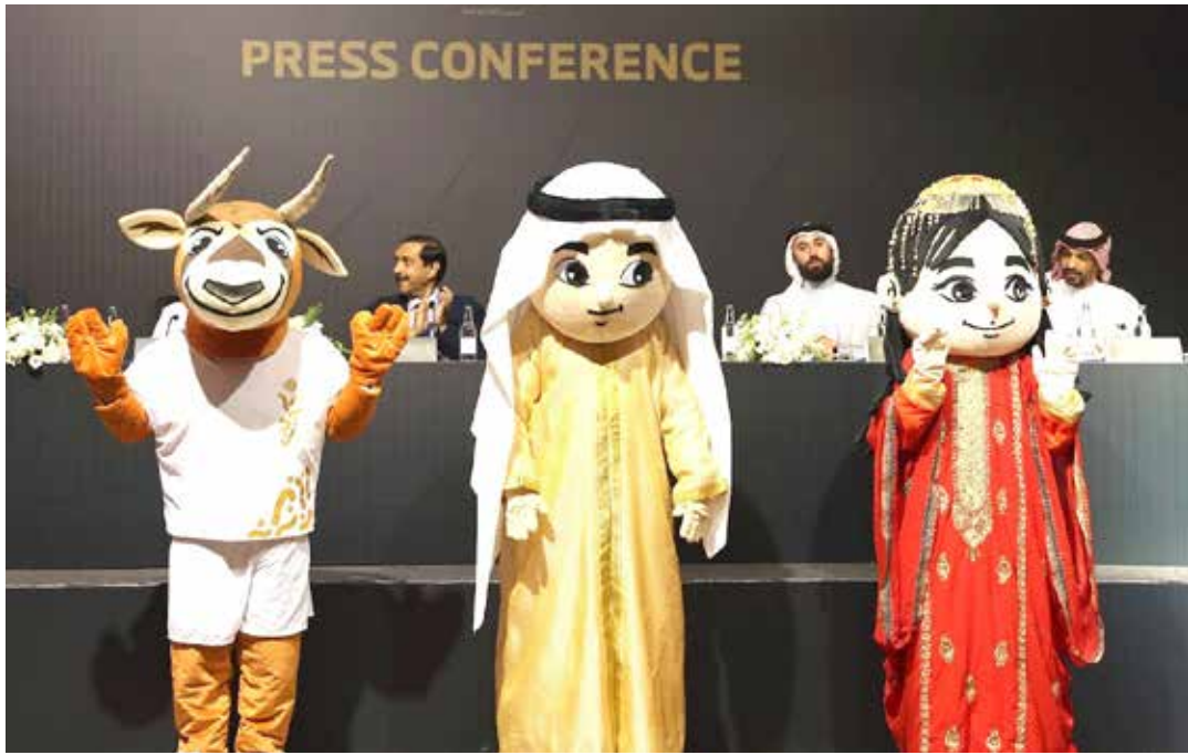
Official mascot “Shihab” unveiled alongside welcoming mascots “Najm” and “Dana”

Zone 1 centers on Isa Sports City, hosting track and field from October 23–26, handball and futsal from October 21 and 23–27, and volleyball and kabaddi competitions across multiple halls. Zone 2 at Exhibition World will feature table tennis, MMA, e-sports, taekwondo, Muay Thai, jiu-jitsu, boxing, judo, teqball, weightlifting, and wrestling. Subzones include C: Military Sports Association and Royal Golf Club for show jumping and golf, and D: Bahrain International Endurance Village and Sofitel Bahrain Zallaq for camel racing, cross country, endurance, and triathlon events. Accommodation will span Amwaj, Manama, Seef, and Juffair/Adliya, ensur-