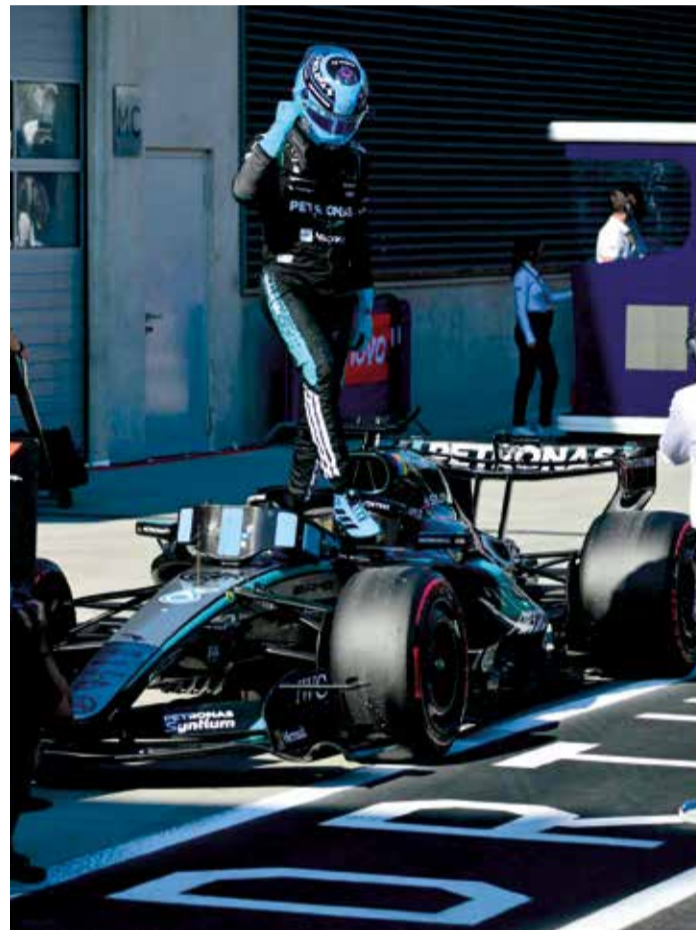
Mercedes' British driver George Russell celebrates his Pole position

firmed when the stewards announced no further action was to be taken against Russell.