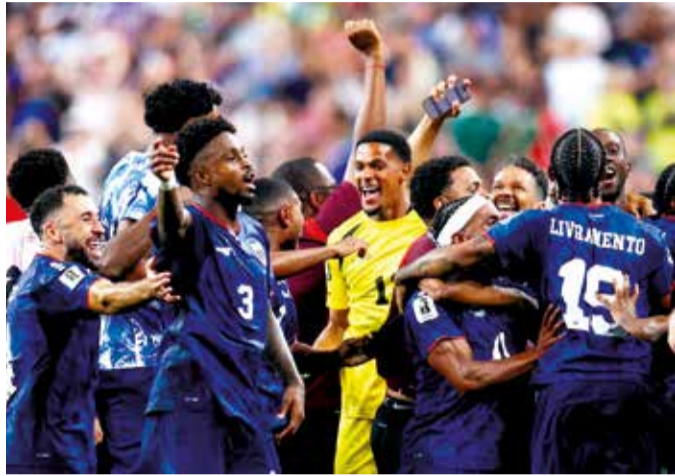
Scenes of celebration after Cape Verde's stalemate with Saudi Arabia