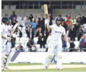
England's Jonny Bairstow, right, raises his bat to celebrate scoring fifty runs