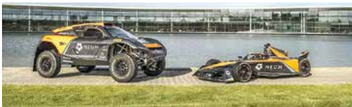
McLaren Formula E Team and Extreme E Team cars with Neom branding

McLaren Racing yesterday announced a new strategic partnership with Neom, a sustainable region in northwest Saudi Arabia being built from the ground up, as the Title Partner of the McLaren Formula E Team and McLaren Extreme E Team from the 2022/2023 season.