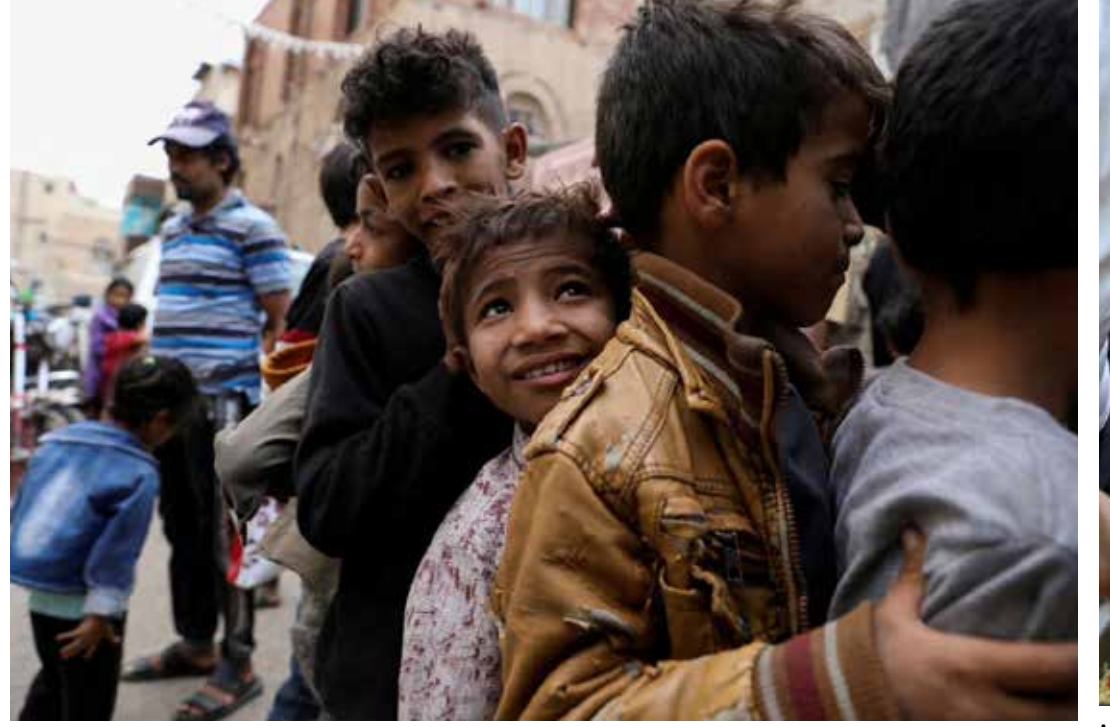
Boys stand in line as they wait to receive meals from a charity kitchen in Sanaa, Yemen

The WFP had since January donors. reduced rations for 8 million