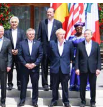
Leaders at the G7 for talks on climate change,

Russia's finance ministry said it made the payments to its onshore National Settlement Depository (NSD) in euros and dollars, adding it had fulfilled obligations. In a call with reporters, Kremlin spokesperson Dmitry Peskov said the fact that payments had been blocked by Euroclear because of Western sanctions on Russia was "not our problem".