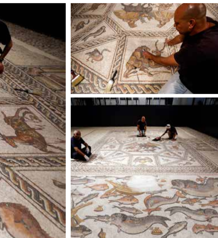
Archaeological centre has been inaugurated, Israel