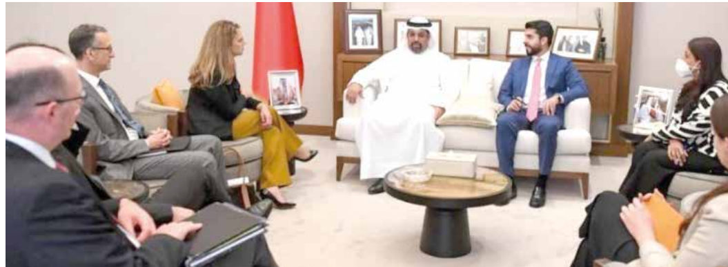
Shaikh Salman receives the US Acting Assistant State Secretary for Near Eastern Affairs