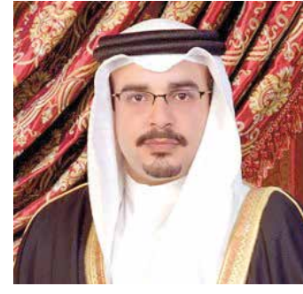
HRH the Crown Prince and Prime Minister

His Royal Highness Prince Salman bin Hamad Al Khalifa, the Crown Prince and Prime Minister, yesterday issued Edict (35) of 2022, appointing the following directors at the Ministry of Education: