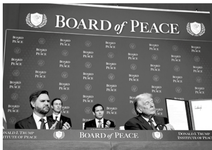
US Vice President JD Vance, Jared Kushner, US Secretary of State Marco Rubio look on as US President Donald Trump holds up a resolution document that he signed during the inaugural meeting of the "Board of Peace"

Israeli military operations in Gaza have continued despite the ceasefire, with at least 190