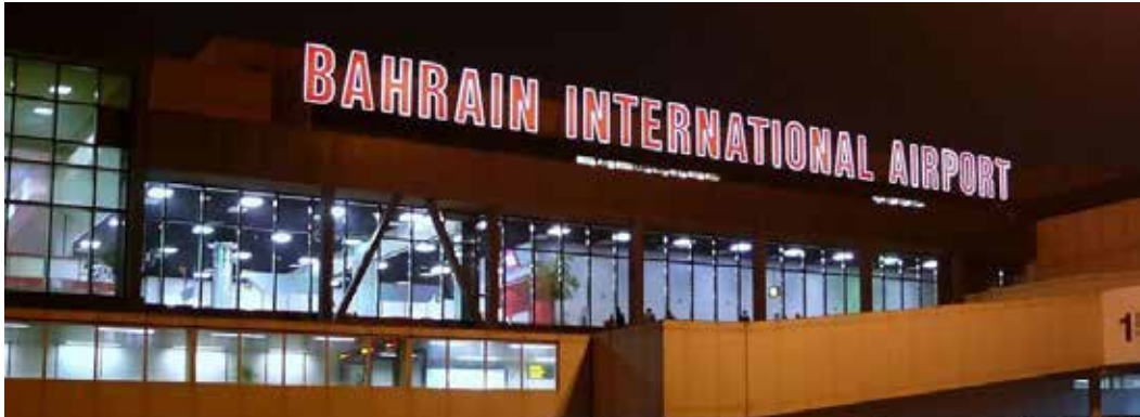
Both the suspects were arrested at Bahrain International Airport