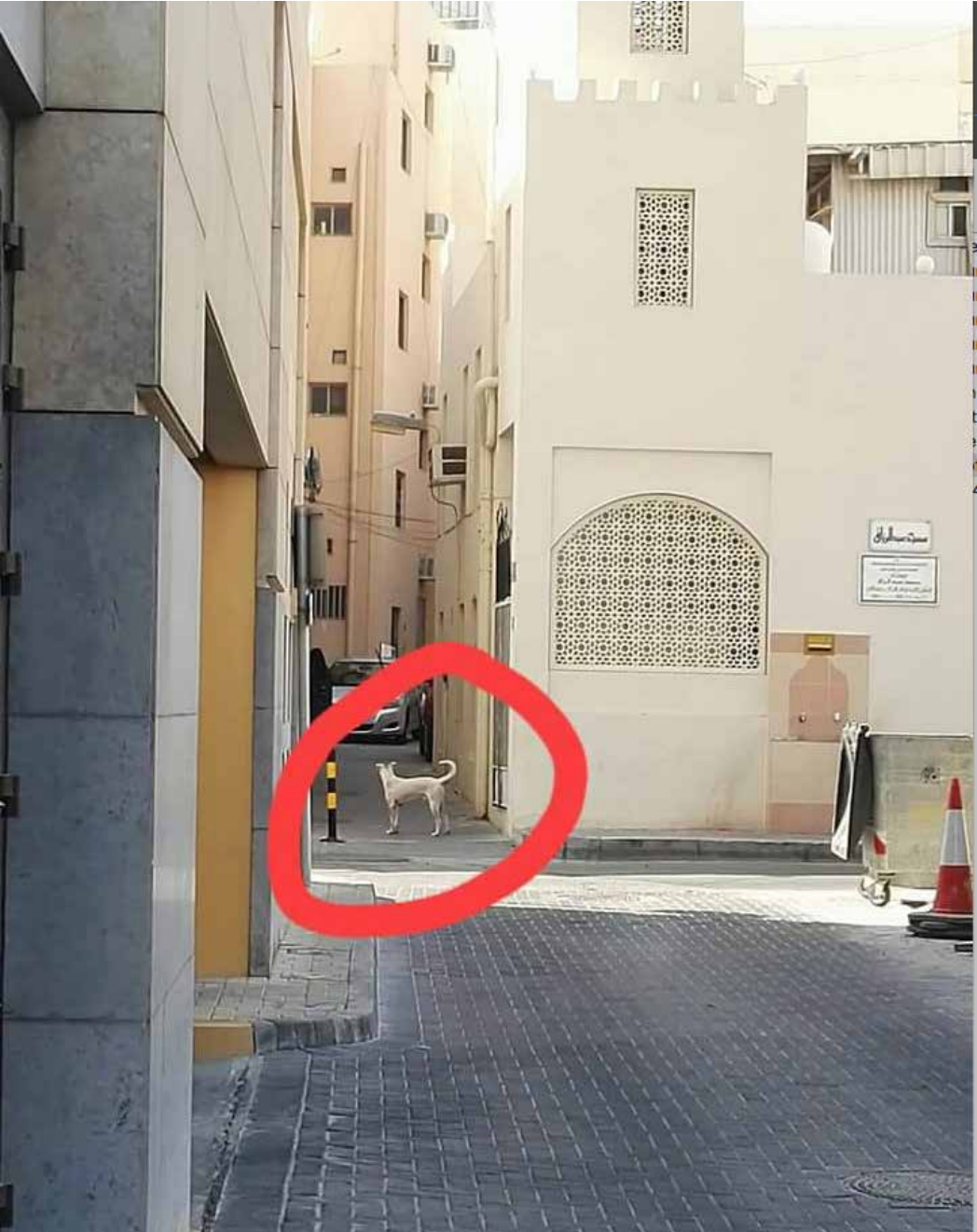
One of the dogs that attacked the man spotted later