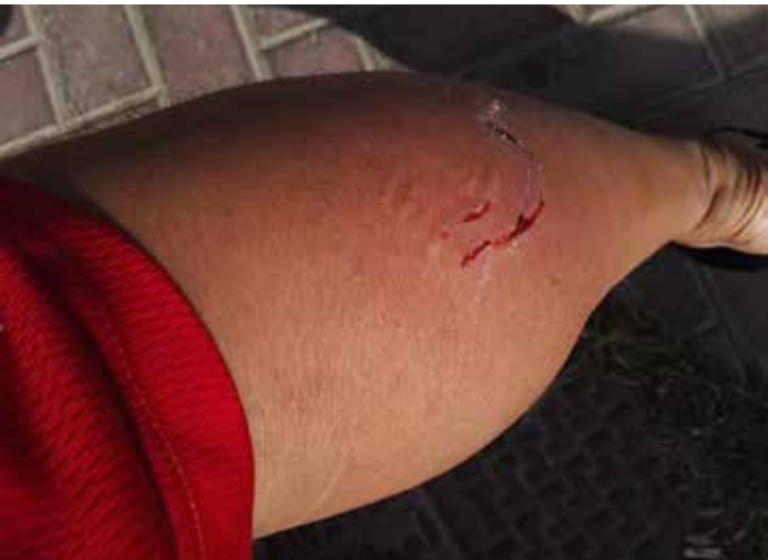
One of the dogs bit the man's leg

The man reported the incident to the nearest police station and immediately went to