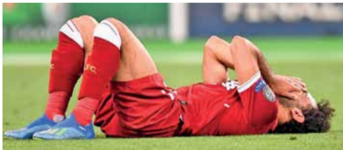
Mohamed Salah grimaces on the ground

Liverpool and Egypt forward Mohamed Salah says he is "confident" of playing in the World Cup after suffering a shoulder injury in the Champions League final defeat by Real Madrid. Salah, 25, left the pitch in Kiev in tears after a first-half challenge with Real Madrid captain Sergio Ramos. "Your love and support will