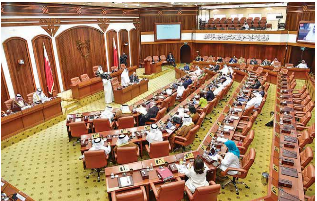
Shura in session

“This law is one of the most important laws that have been put in place to ensure the protection of the rights of individuals. It serves the development of the Kingdom's legislative system to improve the protection of