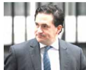
Johnny Mercer London, United Kingdom

UK government minister is on a collision course with the law over his refusal to reveal the sources of allegations that British special forces committed war crimes in Afghanistan.