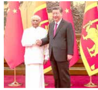
Gunawardena (L) shaking hands with China's President Xi Jinping

Sri Lanka's prime minister said yesterday that China has pledged to develop the island nation's strategic deep sea port and the capital's airport after talks with his counterpart in Beijing.