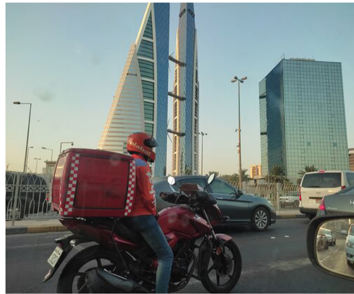
A food delivery rider in the Kingdom

prefer midnight deliveries because at that time, I don't have to worry about opening my fast. During Ramadan, most people place their orders just before Maghrib and during midnight."