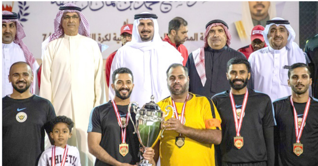
HH Shaikh Mohammed bin Salman (third from left of top row) with the champions on the occasion.

The Commander of the Royal Artillery presented His Highness with a souvenir to celebrate