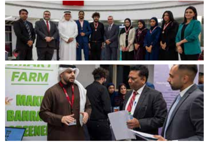
University of Technology Bahrain officials, faculty members, industry experts, graduating and junior students, alumni and media at the event.