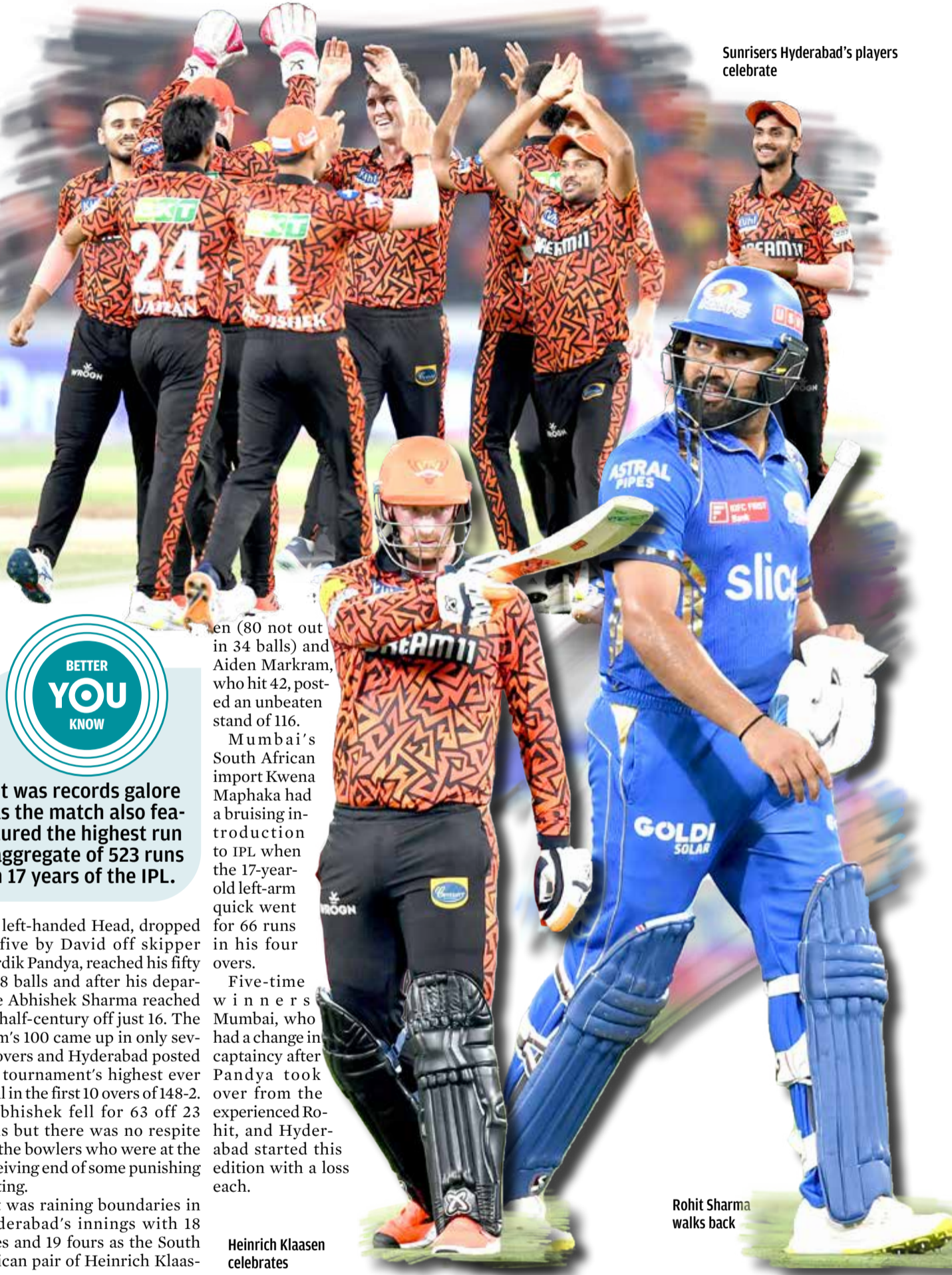
Sunrisers Hyderabad's players celebrate

Hyderabad skipper Pat Cummins was the best of the bowlers with 2-35 in his four overs of pace, leading his side to their first win of the season. Earlier