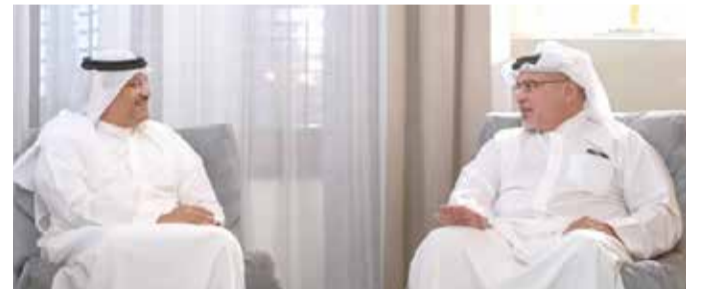
HRH the Crown Prince and Prime Minister with the BACA President TD | Manama

His Royal Highness Prince Salman bin Hamad Al Khalifa, the Crown Prince and Prime Minister, emphasised the importance of continuing to strengthen Bahrain Authority for Culture and Antiquities's role in achieving the Kingdom's comprehensive development, led by His Majesty King Hamad bin Isa Al Khalifa.