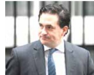
Johnny Mercer London, United Kingdom

A UK government minister is on a collision course with the law over his refusal to reveal the sources of allegations that British special forces committed war crimes in Afghanistan.