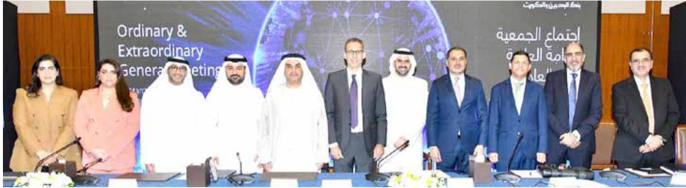
Officials posing for a group photo session during annual general meeting yesterday