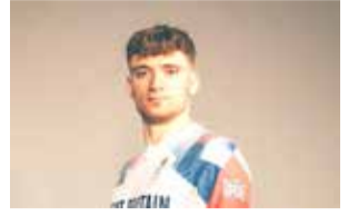
London, United Kingdom

B ritish Olympic diving champion Matty Lee, who won gold alongside Tom Daley three years ago, will miss the Paris Games following spinal surgery.