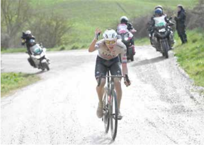
Slovenian Tadej Pogacar, team UAE, takes the lead of the 18th one-day classic 'Strade Bianche' (White Roads) cycling race between Siena and Siena, Tuscany

The accident occurred on a three-lane highway where there appeared to be one lane slightly higher than the neighbouring two. Other high-profile riders hurt were Eritrea's Biniam Gir-