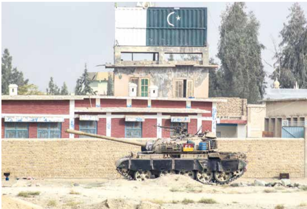
A Pakistani armoured vehicle stands at the Pakistan-Afghanistan border in Chaman

dozens of soldiers in the latest round of border violence, which followed multiple Pakistani strikes on Afghanistan and clashes along the frontier in recent months.