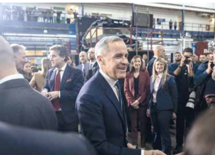
Canadian Prime Minister Mark Carney greets people after making an announcement in Montreal

"The India-Canada partnership is anchored in shared democratic values, strong people-to-people ties, and expanding cooperation across diverse sectors," ministry spokesman Randhir Jaiswal said in a post on X.