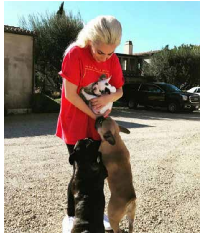
Lady Gagas with her dogs (file photo)