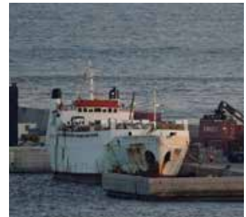
Livestock ship docked in Cartagena

Trump endorses rival to Republican who voted to