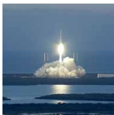
A SpaceX rocket carrying a NASA weather satellite blasts off in February 2015 from Cape Canaveral, Florida