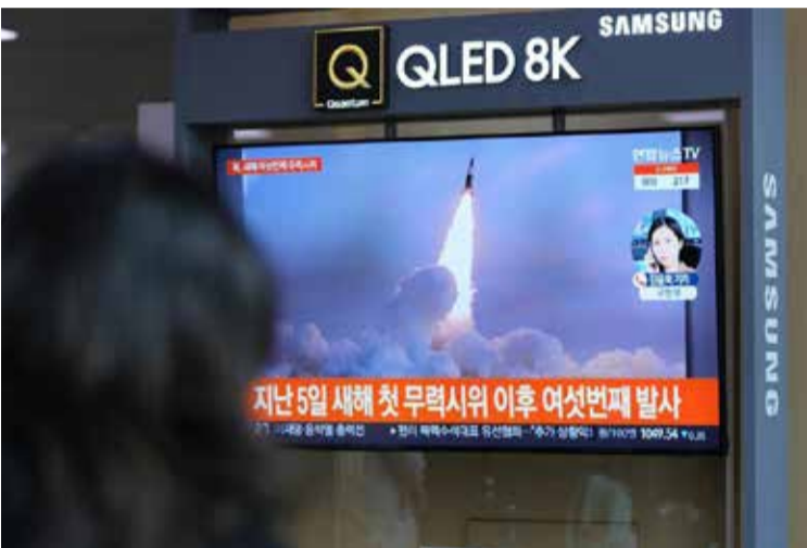
A woman watches a TV screen showing a news program reporting about North Korea's missile launch with a file image

weapons testing in what appears to be a resumption of its provocation and