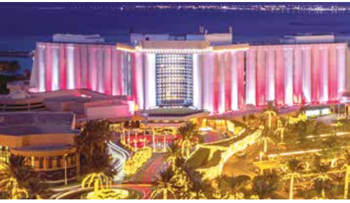
Enjoy great food and a lively party to welcome 2026 at The Ritz-Carlton

The Ritz-Carlton, Bahrain invites residents and visitors to celebrate New Year’s Eve in style with a festive lineup of dining experiences, live entertainment, and an open-air countdown by the sea. Guests can enjoy a journey of global flavors without leaving the Kingdom, with culinary offerings spanning Italy, India, Thailand, and Mexico, culminating in a midnight celebration under the stars. For those seeking a refined dining experience, Plums will host a four-course dinner featuring a seafood starter, seasonal soup, prime beef main course, and a citrus-inspired dessert, offering a sophisticated conclusion to 2025. The dinner is priced at BD55 per person and will be served