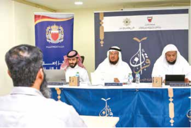
The Reformation and Rehabilitation Centre, in cooperation with the Directorate of Quranic Affairs at the Ministry of Justice, Islamic Affairs and Endowments, organised the final qualifying rounds of the Bahrain Grand Quran Award (Ghufran) for 29 inmates. This initiative is part of the Ministry of the Interior's commitment to implementing reformatory and religious programmes that strengthen faith-based values and promote positive behaviour among inmates by providing opportunities to participate in Quranic competitions and develop their skills in memorising and reciting the Holy Quran.