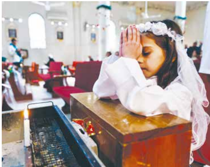
A young Christian worshipper prays during Christmas celebrations at the Holy Family Parish in Gaza City

Under normal conditions, Al-Awda Hospital consumes