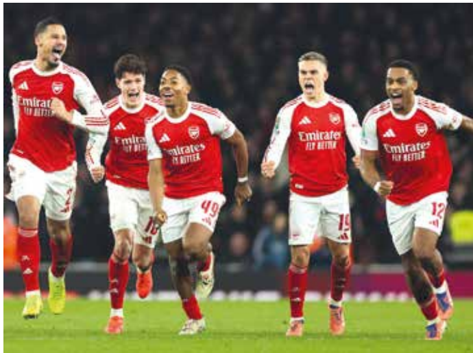
Arsenal's players celebrate winning League Cup quarter-final match

"I remember it very well," said Arteta as he reflected on the fixture. "I was very pissed off in the manner that we played with