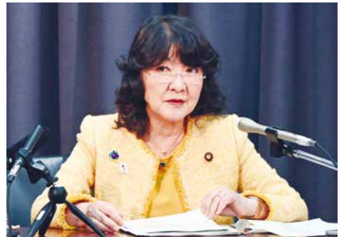
Japan's Finance Minister Satsuki Katayama holds a press conference after the cabinet's approval of the fiscal 2026 budget proposal at the Finance Ministry in Tokyo