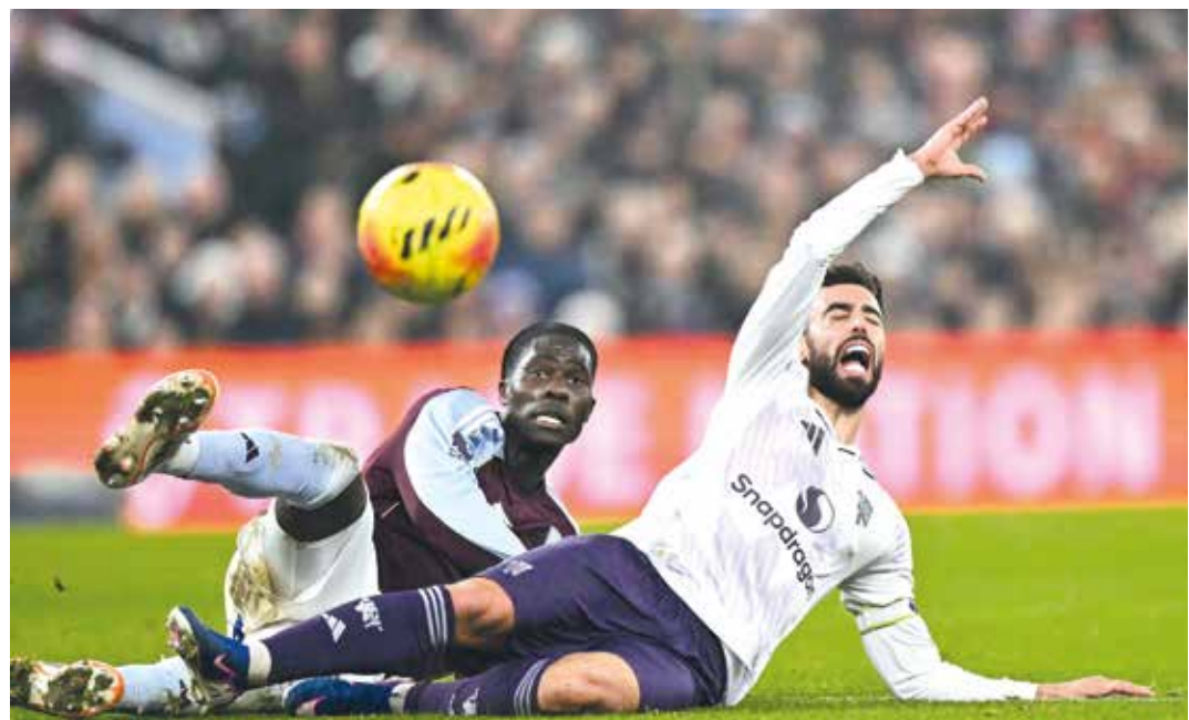
Aston Villa's Belgian midfielder #24 Amadou Onana (L) fouls Manchester United's Portuguese midfielder #08 Bruno Fernandes (R)

Playmaker Fernandes has five goals and seven assists in the Premier League this season for inconsistent United, who are also without top-scorer Bryan Mbeumo, on Africa Cup of Nations duty with Cameroon.