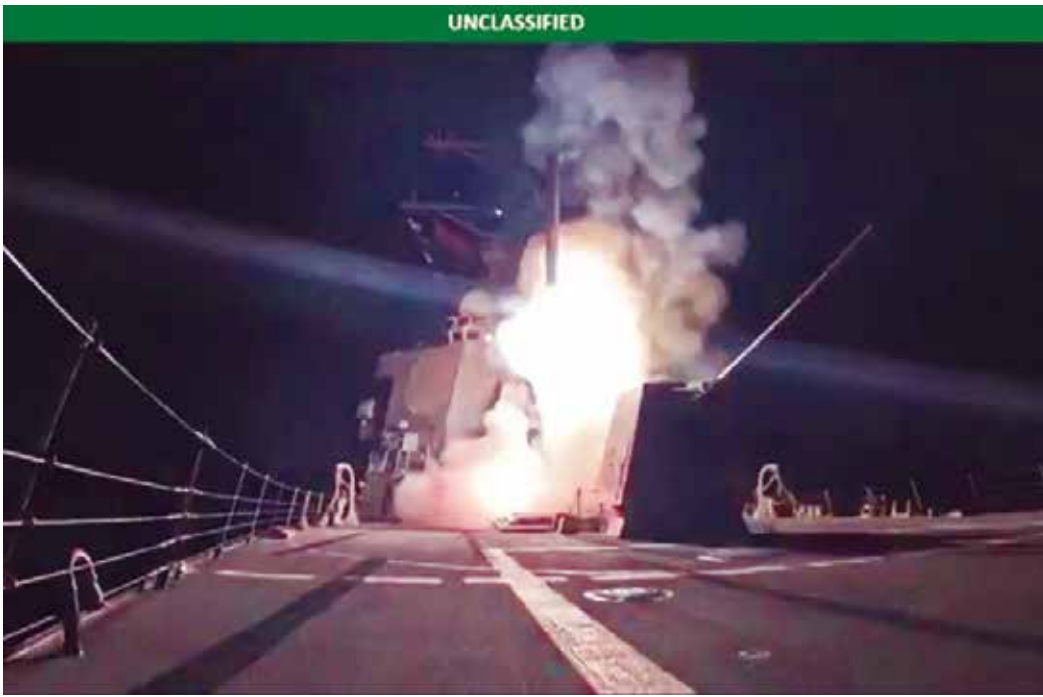
A missile launch from a naval vessel as President Donald Trump says US forces conducted "powerful and deadly" strikes against Islamic State militants in northwestern Nigeria

● The Department of Defense's US Africa Command, using an acronym for the Islamic State group, said "multiple ISIS terrorists" were killed in an attack in the northwestern state of Sokoto.