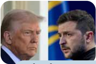
Zelensky to meet Trump this weekend in Florida

Volodymyr Zelensky said yesterday that he would meet US President Donald Trump this weekend to discuss efforts to end Russia's invasion. "Over the weekend, I think on Sunday, in Florida, we will have a meeting with President Trump," Zelensky said in a message to journalists. The latest round of US-Ukraine negotiations produced a 20-point plan to end the war, which has been sent to Moscow. "We will discuss these documents, security guarantees," Zelensky said. "As for sensitive issues, we will discuss Donbas and the Zaporizhzhia nuclear power plant, and we will certainly discuss other issues," he added. Zelensky said this week there was still disagreements between Kyiv and Washington over the two issues. Despite that, Ukraine won some concessions in the latest plan, which would freeze the frontline and remove a requirement for Kyiv to legally renounce its bid to join NATO, Zelensky said.