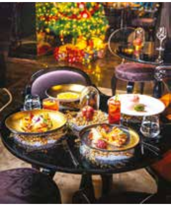
TDT | Manama

As an example of recent delivery, the ministry said Madinat Sitra Housing City has been opened and 1,077 homes have been handed over. It said work began in early 2024 on a second phase of 531 homes, now in its final stages and due to be handed over in the coming weeks.