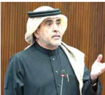
MP Khaled Buanaq

Under the change, it said, support will run through to the end of the repayment period