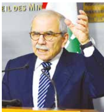
Lebanon's Prime Minister Nawaf Salam

mates, the losses resulting from the financial crisis amounted to about $70 billion, a figure that is