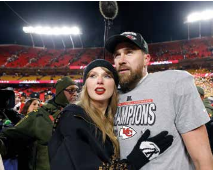
Taylor Swift and Travis Kelce