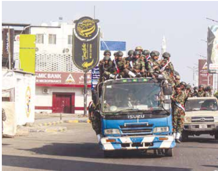
Yemeni armed forces ride in the back of a lorry as the Southern Armed Forces Command celebrate the 58th anniversary of National Independence Day, in the port city of Aden, in the southern part of the Arabian peninsula

A video aired on separatist-affiliated media showed a plume of smoke rising from the desert, with four-wheel white cars in the