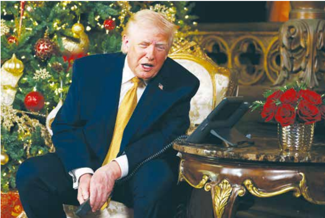
U.S. President Donald Trump calls children as he participates in tracking Santa Claus' movements with the North American Aerospace Defense Command (NORAD) Santa Tracker on Christmas Eve at the Mar-a-Lago resort