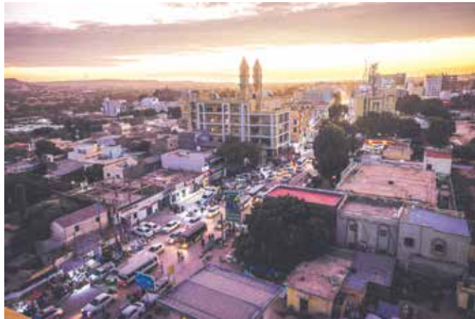
a general view of the city of Hargeisa, capital and largest city of the self-proclaimed Republic of Somaliland.