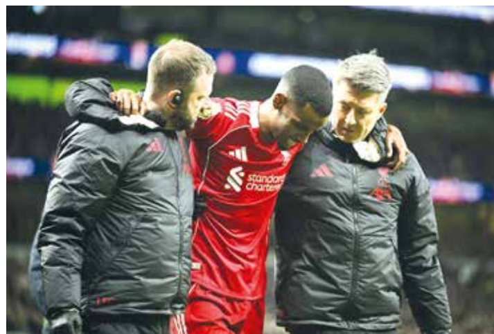
Liverpool's Swedish striker #09 Alexander Isak (C) is helped off the field by medical staff