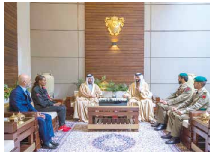
HH Shaikh Nasser bin Hamad Al Khalifa and HH Shaikh Khalid bin Hamad Al Khalifa with the athletes during the meeting