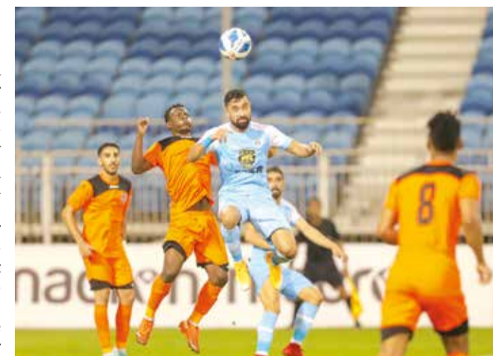
Action from Riffa's Round of 16 victory over Al Hala (File photo)

The winners of the Riffa-Muharraq and Manama-East Riffa contests will face off in the semi-finals, while the victors of Ahli-Najma and Khaldiya-Hidd clash in the other final four