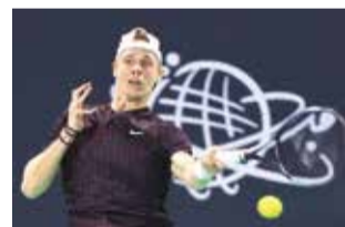
Denis Shapovalov | Sydney

World number 14 Denis Shapovalov has tested positive for Covid-19 after arriving in Sydney, he said Sunday, highlighting the virus threat to the Australian Open.