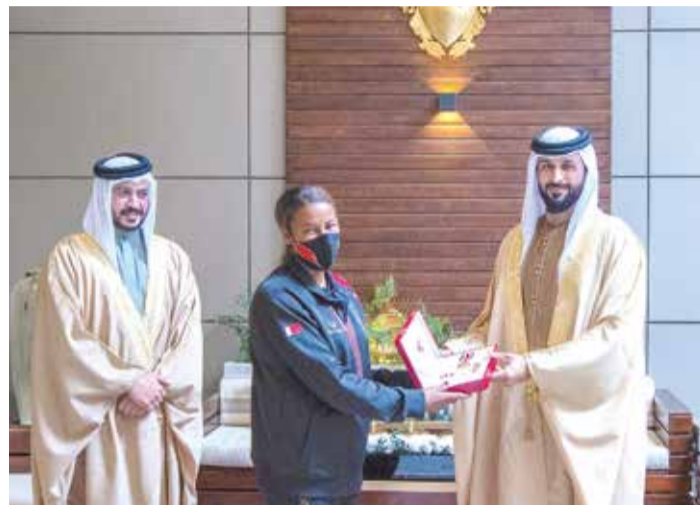
HH Shaikh Nasser bin Hamad Al Khalifa (R) honours Maryam Jamal (C) as HH Shaikh Khalid bin Hamad Al Khalifa looks on

HH Shaikh Nasser bin Hamad Al Khalifa presents medals to athletes for achievements which contributed to raising the kingdom's flags at various sports gatherings