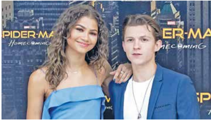
Zendaya and Tom Holland

The Hollywood couple first met on the set of their movie 'Spider-Man: Homecoming' in 2016 - which saw Tom take on the role of the titular superhero and Zendaya play his love inter-