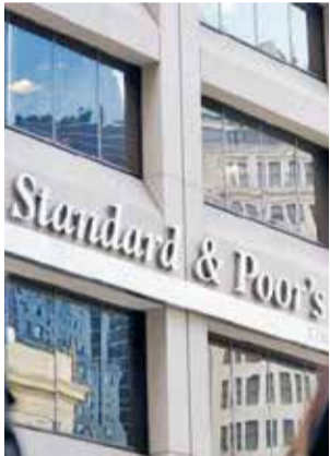
TDT | Manama

Bahrain's outlook has been raised to positive from stable by S&P Global Ratings which also affirmed the 'B+/B' ratings of the Kingdom, citing ongoing fiscal reforms and solid growth in non-oil receipts. The global rating agency said the brighter outlook reflects expectations that the Kingdom will continue fiscal reforms and that the country could benefit from additional support from other Gulf Cooperation Council sovereigns if necessary. "Solid growth in non-oil receipts and budget consolidation measures are easing pressure on fiscal position," S&P said while affirming the local currency sovereign credit ratings. Among the policies welcomed by the agency were expenditure cuts and a doubling of value-added taxes in January. "Bahrain's relatively diverse economy benefits from proximity to the large Saudi Arabian market, strong regulatory oversight of the financial sector, a relatively well-educated workforce, and low-cost environment," S&P said. "The economy is also benefiting from an increase in regional activity," S&P added. The agency expects the economy of Bahrain to expand by 4.8% in 2022.