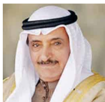
Shaikh Salman bin Hamad Al Khalifa, the Chairman of the Survey and Land Registration Authority, the Real Estate Regulatory Agency, and Higher Organising Committee for Cityscape Bahrain 2022, thanked His Majesty King Hamad bin Isa Al Khalifa and HRH Prince Salman bin Hamad Al Khalifa, the Crown Prince and Prime Minister, for the royal care.

Shaikh Salman bin Abdulah bin Hamad Al Khalifa, the Chairman of the Survey and Land Registration Authority, the Real Estate Regulatory Agency, and Higher Organising Committee for Cityscape Bahrain 2022, thanked His Majesty King Hamad bin Isa Al Khalifa and HRH Prince Salman bin Hamad Al Khalifa, the Crown Prince and Prime Minister, for the royal care. HRH's attention, he said, has contributed to the promotion of Bahrain as a prime destination for investment in the real estate sector.