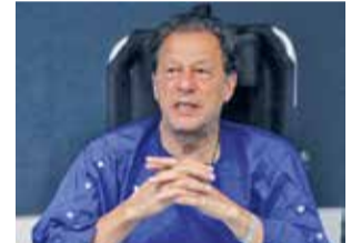
Former Pakistan's Prime Minister Imran Khan