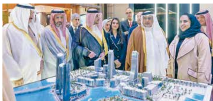
His Royal Highness Prince Salman bin Hamad Al Khalifa, the Crown Prince and Prime Minister, opened the first edition of Cityscape Bahrain 2022 on Tuesday at Exhibition World Bahrain in Sakhir.

Cityscape Bahrain, the region's largest real estate summit and exhibition, concluded yesterday on a high note after extending by a day and witnessing a record 101 million dinars of sales. The sales were through 40 of the most prominent real estate development companies, both inside and outside the Kingdom. Altogether, the expo offered 10,000 properties, including villas, apartments, lands, and real estate projects collectively worth BD 967 million. The quality and diversity of the projects on offer also attracted tremendous footfall, with more than 10,000 flocking to the expo in about five days.