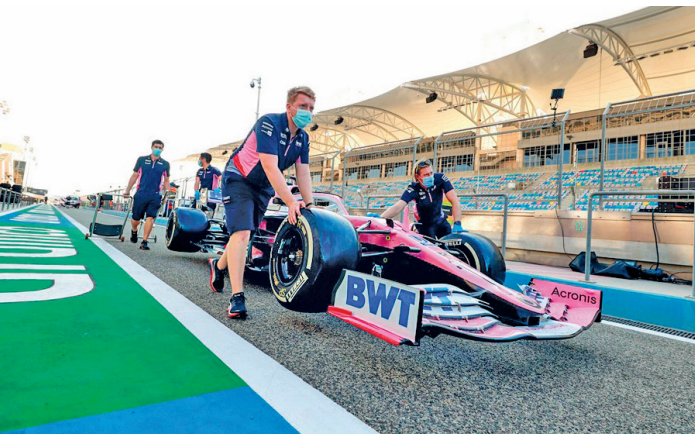
Racing Point mechanics wheel one of their cars down the F1 Pit Lane after coming from scrutineering

F2 is staging the penultimate round of its 2020 season at the Gulf Air Bahrain Grand Prix, while the Porsche Sprint Challenge is taking to the track for the first round of its 2020/2021 campaign.