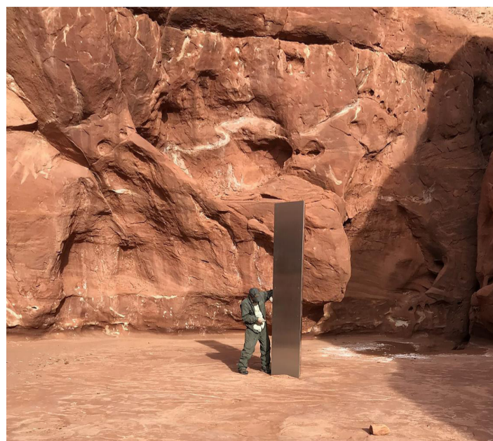
A Utah state worker inspecting a metal monolith that was found installed in the ground in a remote area of red rock in Utah

They found the three-sided stainless-steel object is about as tall as two men put together. But they discovered no clues about who might have driven it into the ground among the undulating