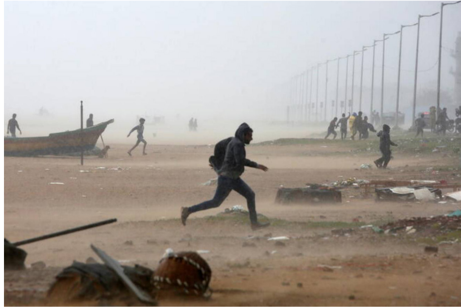
People run from the Marina beach after sudden heavy rains before Cyclone Nivar's landfall, in Chennai

Rescue personnel ferried cooked food to the people using inflatable boats. The residents of some of the affected areas shifted to the homes of their relatives, while others continued to stay put battling the odds.