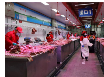
Xinfadi market in Beijing

China's biggest wholesale food market has suspended the sale and storage of chilled and frozen meat and seafood as the government ramps up inspections of cold-chain goods after several new cases of coronavirus infections.