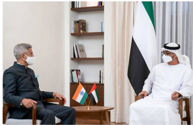
S Jaishankar during his meeting with Abu Dhabi Crown Prince Sheikh Mohammed bin Zayed Al Nahyan

'Appreciated their stepping forward to work with the Embassy @IndembAbuDhabi to meet the