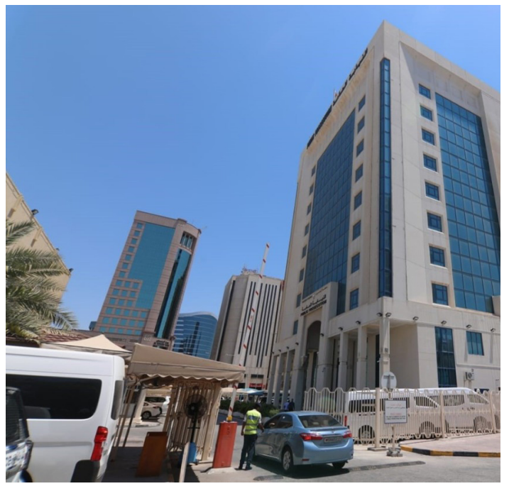
Investigation resulted in handing over the case to Public Prosecution and the Fourth High Criminal Court.

trusting the women, flew to by the first defendant, only to