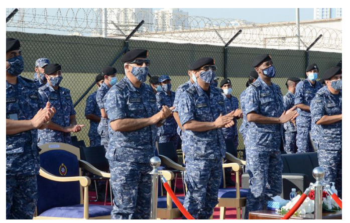
Royal Bahrain Naval Force (RBNF)'s Salman Naval Base welcomed her with an official ceremony.

She, reportedly, is powered by two Ruston 12RK 270 engines developing 4,125 kW (5,532 hp) at 1,000 rpm, the report said.