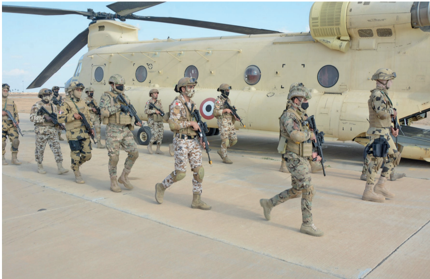
Bahraini forces showcased their accuracy in hitting targets and high manoeuvrability, alongside sisterly Arab forces

Bahraini forces showcased their accuracy in hitting targets and high manoeuvrability, alongside sisterly Arab forces participating in the exercise which included including para