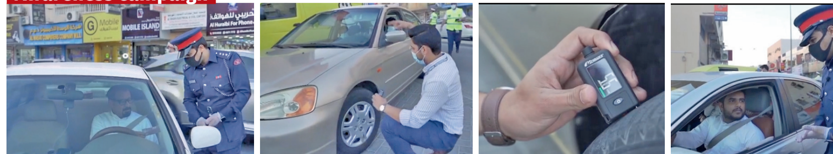
Traffic police officials during an awareness campaign for drivers in preparation for the upcoming rainy season. Police officials provided instruction to the drivers in cooperation with the southern governorate. The officials also honoured drivers for strictly following the laws. The Department provided them with free tires and other gifts