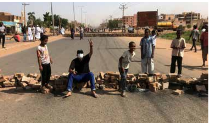
Protesters block a road

Main roads and bridges between Khartoum and Omdurman were closed to vehicles by the military. Banks and cash machines were shut, and mobile phone apps widely used for money transfers could not be accessed.