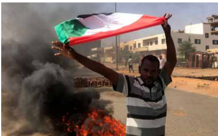
A protester waves a flag