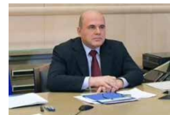
Russian Prime Minister Mikhail Mishustin

Doctors report packed wards and a heavy strain on resources and staff, including junior doctors and medical students who have been brought in to help.