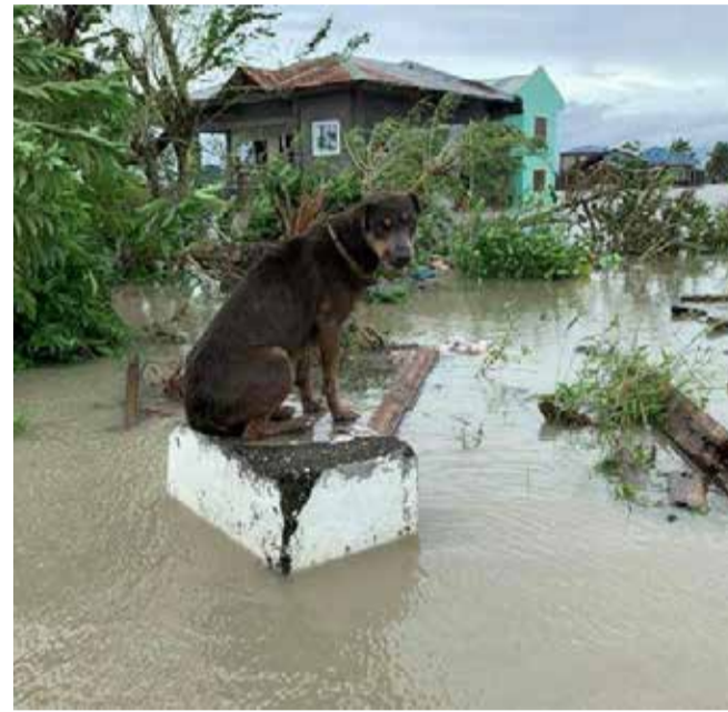
A dog sits on a submerged concrete post in Pola, Oriental Mindoro province, after the typhoon hit

● Packing maximum sustained winds of 130 kilometres (80 miles) per hour, Typhoon Molave made landfall Sunday