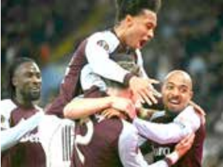
Players celebrate after a goal

Aston Villa ended their winless run by beating Bologna 1-0 to open their Europa League campaign, while Rangers manager Russell Martin's job was placed into peril by a 1-0 home defeat to Genk on Thursday.