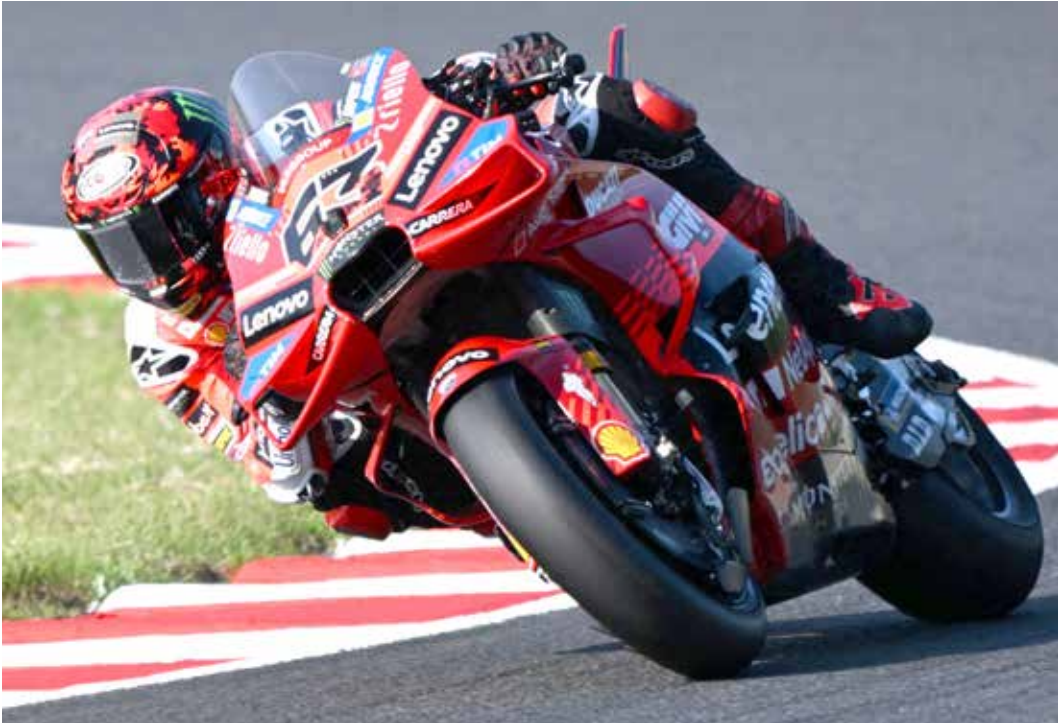
Ducati Lenovo Team's Spanish MotoGP rider Marc Marquez rides during a practice session

Marquez is looking to win his seventh world title in Japan this weekend after dominating the competition with 11 Grand Prix