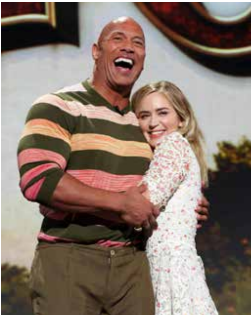
Emily Blunt and Dwayne Johnson

He said: “I also want to give Emily her flowers too. She is one of the greatest actors of our time — of all time. And also one of my best friends.