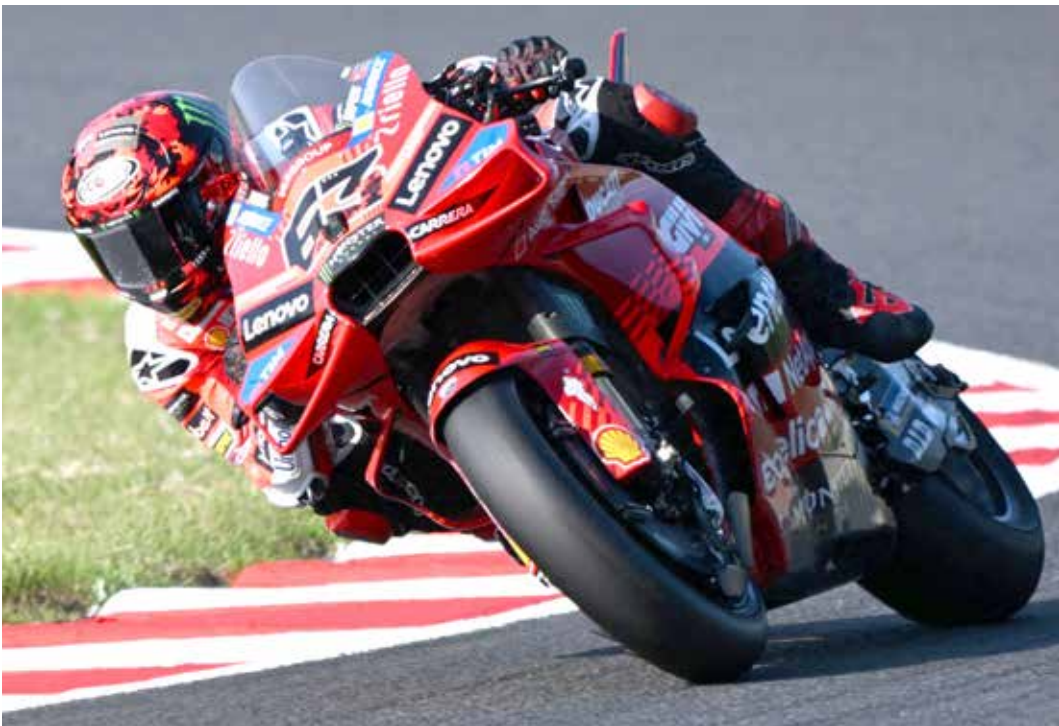
Ducati Lenovo Team's Spanish MotoGP rider Marc Marquez rides during a practice session

Championship-chasing Marc Marquez clocked the third-fastest time of an action-packed practice for the Japan MotoGP yesterday as he looks to clinch his first world title since 2019.