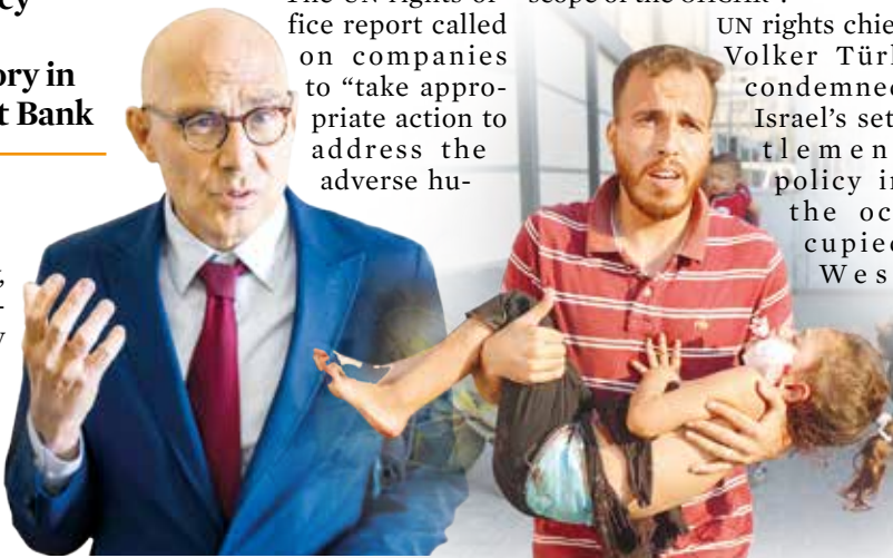
A Palestinian man rush a wounded girl into the al-Awda Hospital

"A total of 68 new companies were added to the list published in 2023, while seven of those... were removed as they were no longer involved in any of the activities concerned," the rights office said.