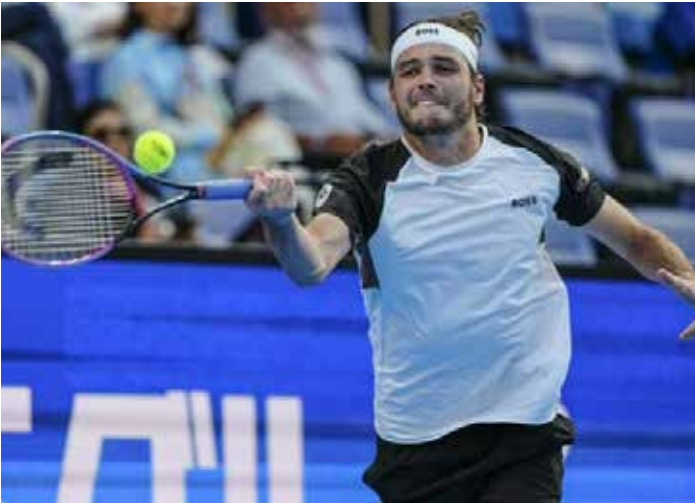
Taylor Fritz in action

T aylor Fritz said yesterday he expects Carlos Alcaraz and Jannik Sinner to continue dominating Grand Slams but he "can't count on them not being there" if he wants to win one. World number one Alcaraz and number two Sinner have contested every Grand Slam final this year, with American Fritz the last player to break up the duopoly. Fritz, now the world number five, reached last year's US Open final, where he lost to Italy's Sinner. Fritz, who beat Portugal's Nuno Borges 7-5, 7-6 (7/4) at the Japan Open on Saturday, said he could not afford to be afraid of meeting the top two if he wants to win his first Grand Slam title. "I can't count on making it