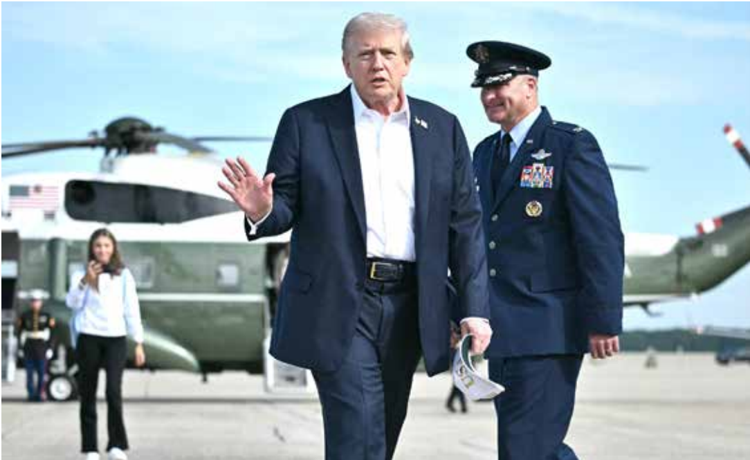
US President Donald Trump waves as he makes his way to board Air Force One

Presidents have historically bent over backward -- at least in public -- to show clear separation between the White House and the Justice Department. Trump has smashed that precedent, making clear he intends to influence Comey’s case -- and others.