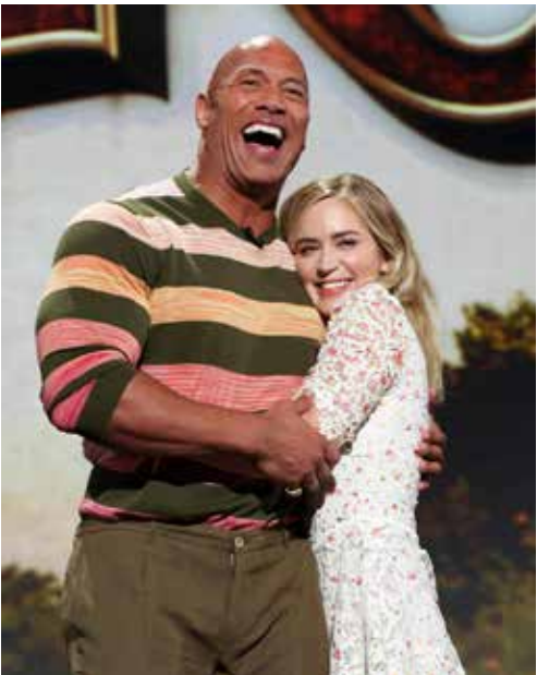
Emily Blunt and Dwayne Johnson

had imagined. “He was so gentle and quite interior and sort of contemplative and kind, just easy. Like, so lovely to be around, funny and quick, all these qualities.” Dwayne also heaped praise on his co-star, describing Emily as one of his “best friends”. He said: “I also want to give Emily her flowers too. She is one of the greatest actors of our time — of all time. And also one of my best friends.