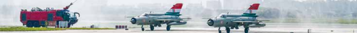
A firefighter gives a water cannon salute to India's MiG-21 fighter jets during their farewell ceremony at the Chandigarh Air Force Station in Chandigarh

Plans to retire them in the 1990s were repeatedly delayed amid local production setbacks, bureaucratic obstacles and corruption scandals.