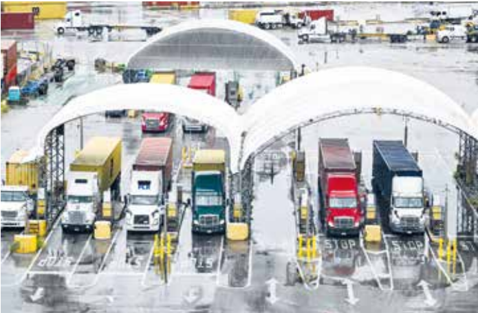
(FILES) Trucks carrying shipping containers are seen at the Port of Miami in Miami, Florida

Starting October 1, "we will be imposing a 100% Tariff on any branded or patented Pharmaceutical