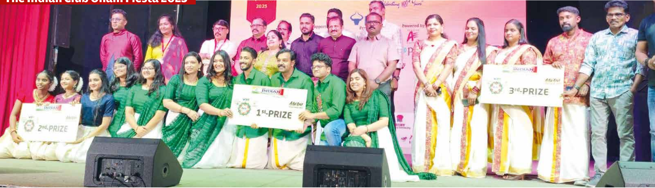
Six teams competed in the traditional Onapattu (Onam songs) competition, held on the third day of 'Aavani - The Indian Club Onam Fiesta 2025'. Onam, a harvest festival celebrated mainly in the Indian state of Kerala, is marked by music, dance, feasts, and cultural performances, and the Onapattu competition is a cherished tradition showcasing the rich musical heritage of the festival. In this year's contest, Swaralaya K.C.A. won the 1st prize, Onathumbikal secured 2nd, and Bahrain Prathiba Swaralaya A took 3rd place. The competition was followed by a lively musical performance by Pink Bang, adding to the festive atmosphere.