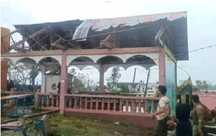
A grab shows people walking past a building with ripped off roof at the height of Severe Tropical Storm (ST5) Bualoi near a church in Masbate City, Bicol region, south of Manila

Civil defence officials in the Bicol region in the south of Luzon island said three people were killed when walls collapsed and trees were uprooted by Severe Tropical Storm Bualoi, which is sweeping west by northwest at sustained speeds of 110 kilometres (70 miles) per hour. Evacuees in one province took