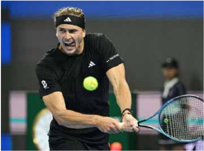
Germany's Alexander Zverev hits a return to Italy's Lorenzo Sonego

A lexander Zverev saw off Lorenzo Sonego 6-4, 6-3 with a decisive ace at the China Open yesterday as Coco Gauff launched her bid for a repeat crown. World number three Zverev, the second seed in Beijing, next faces France's Corentin Moutet. The German and Sonego went toe-to-toe for 50 minutes before Zverev converted a break to edge the 30-year-old Italian in the first set after a brief back-and-forth at the net. A confident Zverev won four