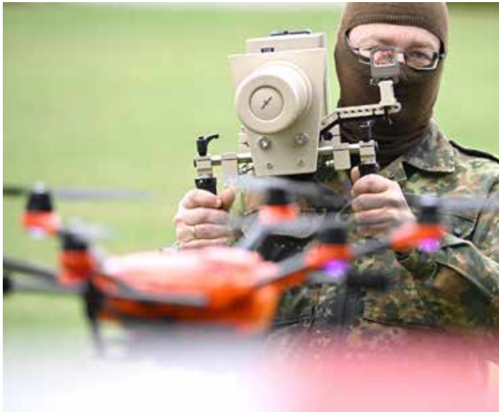
A soldier of the German armed forces Bundeswehr demonstrates the use of a handheld HP 47 drone jammer

Ukraine -- which has developed a raft of capabilities to detect and shoot down Russian