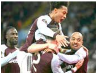
Players celebrate after a goal