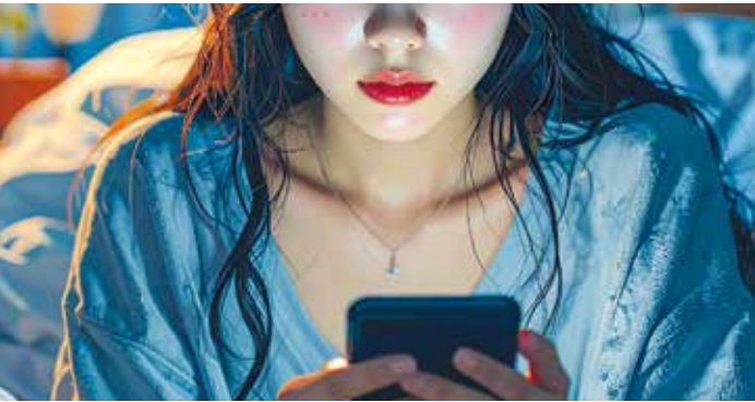
Picture for representation only in preparation for referring the case to the Public Prosecution.

Police have arrested a 22-year-old man accused of trapping and blackmailing a 13-year-old girl through social media, the Ministry of Interior reported. The arrest was made by the Child Protection Unit in Cyberspace at the General Department of Anti-Corruption and Economic and Electronic Security, following a tip-off received by the authorities. All legal measures are being taken