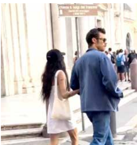
Zoe Kravitz and Harry Styles

A source told The Sun newspaper at the time: "Harry and Taylor have ended their relationship. They went through a rough