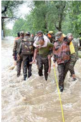
Rising Star Corps troops of Indian Army swung into action, rescuing villagers hit by flash floods in Amli and Nud, Samba, Kachle and Sujanpur, Pathankot, Makaura Pattan and Adalatgarh, Gurdaspur