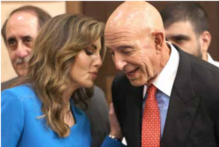
US ambassador to Turkey and special envoy for Syria Tom Barrack (R) speaks to US deputy Middle East envoy Morgan Ortagus

"Act civilised, act kind, act tolerant, because this is the problem with what's happening in the region," added Barrack, who is US ambassador to Turkey and special envoy to Syria and has recently been leading talks with Lebanese officials.