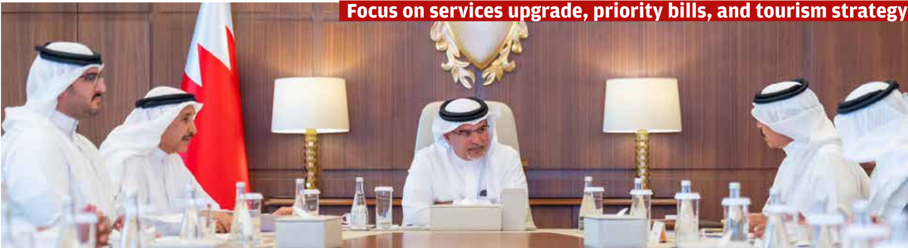
Focus on services upgrade, priority bills, and tourism strategy

His Royal Highness Prince Salman bin Hamad Al Khalifa, the Deputy King and Crown Prince and Prime Minister, yesterday chaired the 510th meeting of the Coordination Committee. During the session, the committee reviewed progress on updating and developing regulatory procedures for several government services. It also examined the latest developments regarding priority draft laws and discussed the ongoing implementation of the Tourism Sector Strategy (2022-2026).