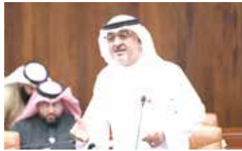
MP Jalal Kadhem

Bahrain Post forms part of Land Transport Affairs at the ministry, which oversees the provision and regulation of postal services, including universal service.