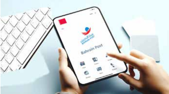
Bahrain Post goes hi-tech to upgrade services

Witnesses were also heard before the case was referred to court. The judgment was delivered yesterday.