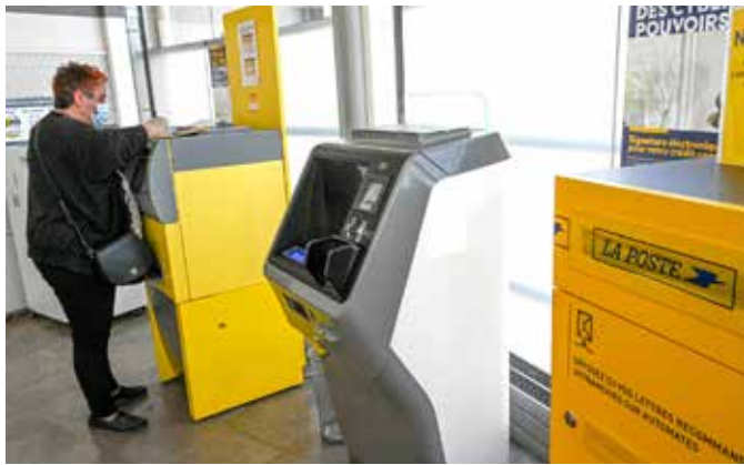
A woman posts mail at the Lunel post office south of France

The UN postal agency said Tuesday that 25 countries had decided to suspend package deliveries to the United States, as concern grows over the impact of President Donald Trump's looming tariffs.