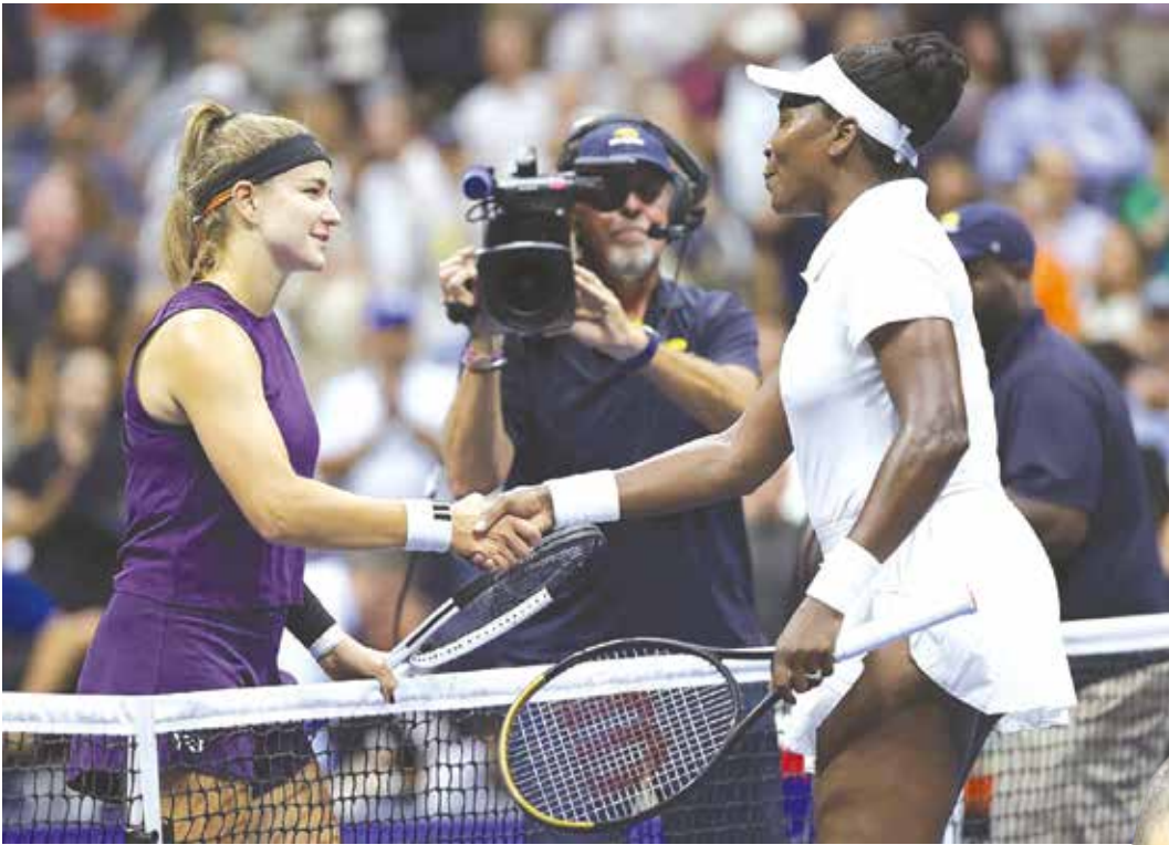
Karolina Muchova of Czech Republic (L) greets Venus Williams of the United States following their match

Venus Williams battled bravely before bowing out of the US Open on her return to Grand Slam tennis on Monday as Spanish ace Carlos Alcaraz stormed into the second round with a dominant opening win. The second full day of action in New York saw all eyes turn to the Arthur Ashe Stadium's night session, where the 45-year-old Williams lost in three sets to 11th seed Karolina Muchova. Williams only returned to competitive tennis in July following a 16-month absence from the sport and had been granted a wild card into the main draw at Flushing Meadows. But hopes of a fairytale run -- 28 years after her debut in the tournament -- ended in a 6-3, 2-6, 6-1 loss to Muchova, who was not even born when Williams turned professional in 1994. "I didn't win today but I'm very proud of the way I played," Williams, the US Open champion in 2000 and 2001, said. "I don't think I've ever had a crowd on my side like that. I knew people around the world and around the United States were really rooting for me, and that felt great." With the American exiting, 2022 men's champion Alcaraz took centre-stage in the late game in his first round tie against unseeded American Reilly Opelka.