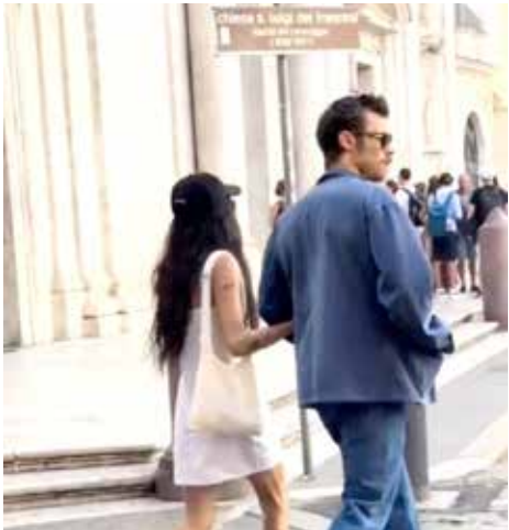
Zoe Kravitz and Harry Styles

Zoe Kravitz and Harry Styles have been spotted together in Rome. The 36-year-old actress and the 31-year-old singer were filmed walking arm-in-arm through the streets of the Italian city, as they took in the sights around them. According to Us Weekly , the fan video - shared on X - showed the pair both wearing dark sunglasses as they enjoyed their day out. Kravitz and Styles’ joint outing comes as a surprise as Zoe is close friends with Harry’s ex Taylor Swift. Meanwhile, Harry has been single since splitting from Taylor Russell in May 2024. A source told The Sun newspaper at the time: “Harry and Taylor have ended their relationship. They went through a rough