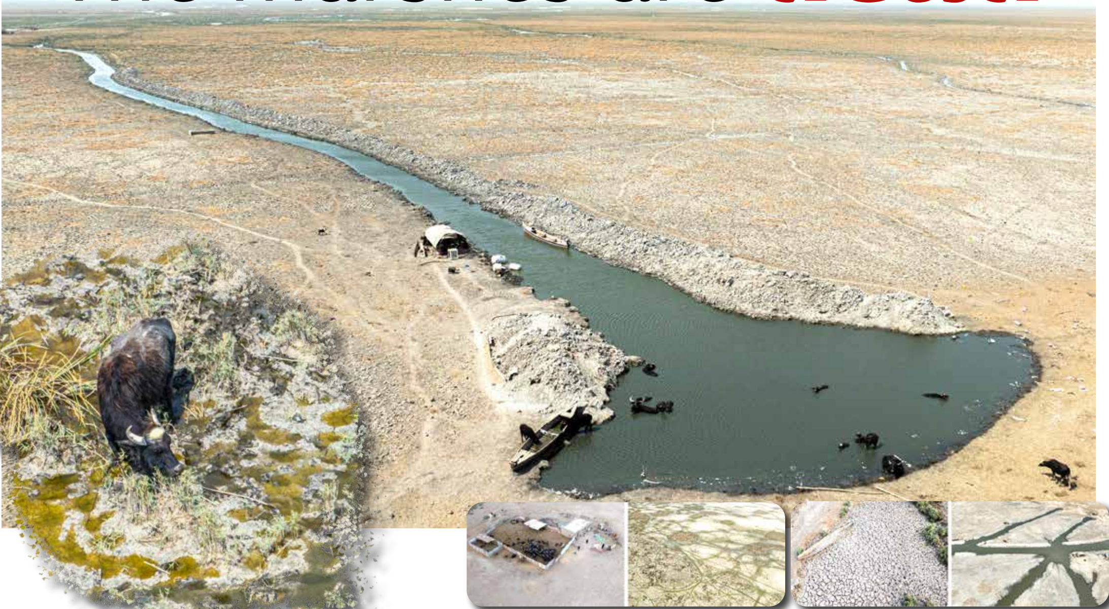
Iraqi buffalo herders wander in search of water