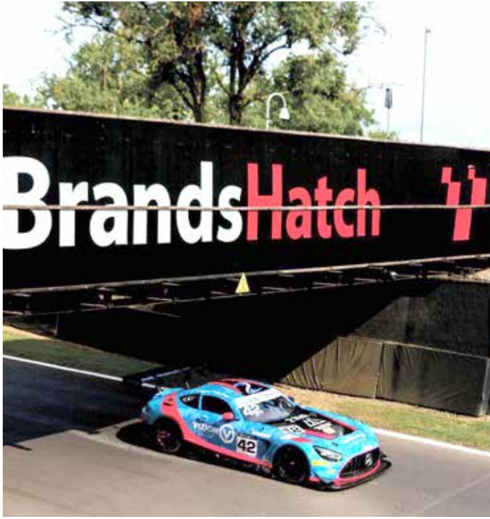
#42 Mercedes-AMG in action

"It demonstrates our ability to compete in the highest-level championships. I extend my sincere gratitude to the team members for their tireless efforts and to our supporters and