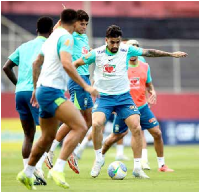
Brazil's forward Lucas Paqueta controls the ball as he takes part in a training session (file photo)

Brazil coach Carlo Ancelotti did not recall Neymar and spared Vinicius Junior for World Cup qualifiers against Chile and Bolivia next month with Lucas Paqueta returning to the national team. The 33-year-old Neymar, who returned to Santos in January, has not worn the Brazil jersey for nearly two years due to repeated injuries. "Neymar had a small problem last week," Ancelotti told a press conference on Monday, without providing further details. According to the Brazilian press, Brazil's leading all-time scorer with 79 goals in 128 matches, has experienced thigh discomfort during training. His absence from the squad for the final two World Cup qualifying matches was, however, played down by Ancelotti with the five-time champions having already booked their ticket to next year's tournament in the United States, Canada,