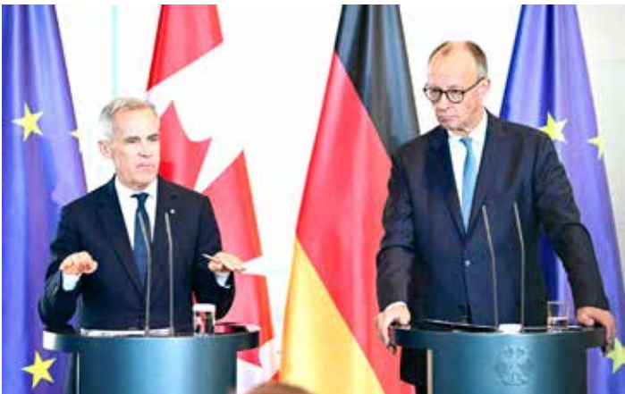
German Chancellor Friedrich Merz (R) and Canada’s Prime Minister Mark Carney hold a joint press conference after bilateral talks at the Chancellery

vate Canada as an alternative source of rare earths as well as other materials such as lithium, graphite, cobalt and nickel.