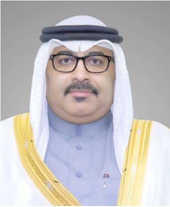
H.E. Dr Mohammed bin Mubarak Juma Investigations into the cause are still ongoing.