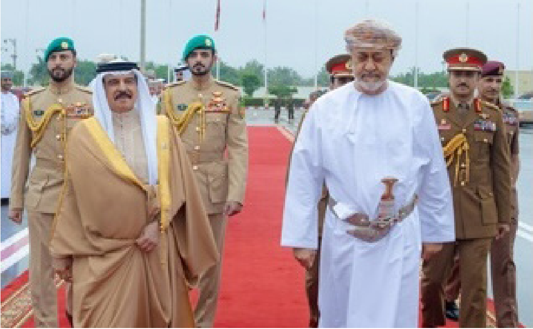
HM the King is seen off by HM Sultan Haitham