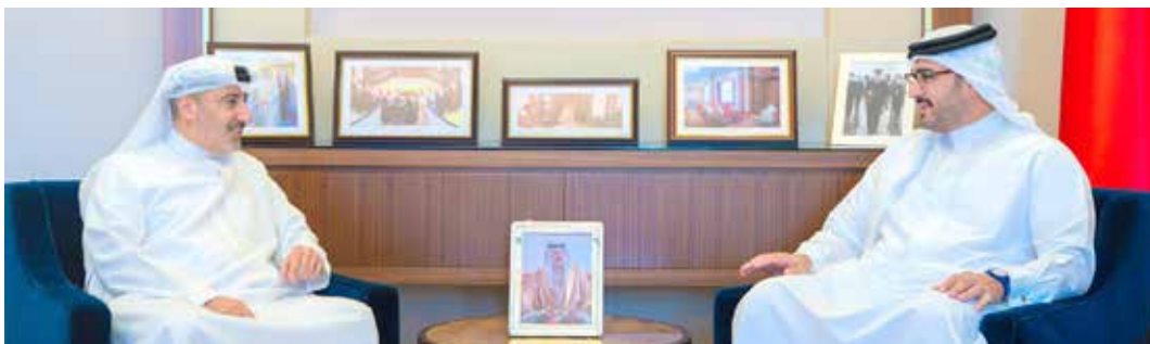
HH Shaikh Isa bin Salman bin Hamad Al Khalifa with H.E. Shaikh Daij bin Salman bin Daij Al Khalifa

At Gudaibiya Palace yesterday, His Highness Shaikh Isa bin Salman bin Hamad Al Khalifa, Minister of the Prime Minister's Court, underlined the Civil Service Bureau's position as the driver of Bahrain's national reform.