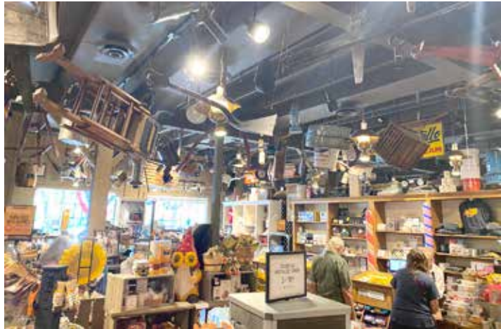
Customers browse inside the Cracker Barrel Old Country Store in Mount Arlington, New Jersey

Cracker Barrel apologized to fans on Monday, saying in a statement it "could've done a