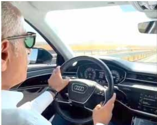
The speed limit on that highway in Turkey is 140 kph (85