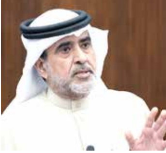
MP Khalid Buanaq

It would also lessen the weight on families and the state