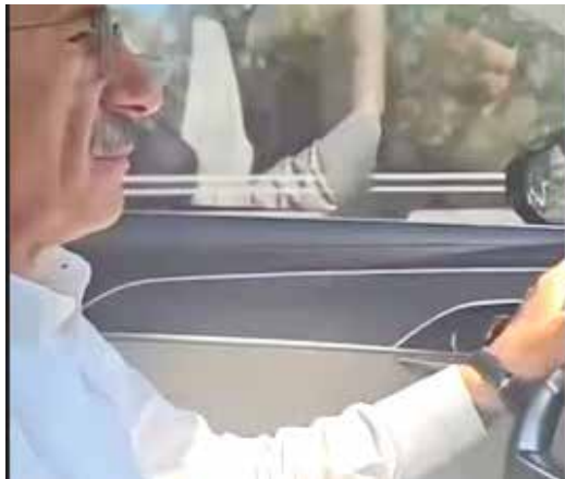
225 kilometres per hour (118 to 140 miles per hour).

In several separate shots that inadvertently show the speedometer, he can be seen clocking up speeds of between 190 and