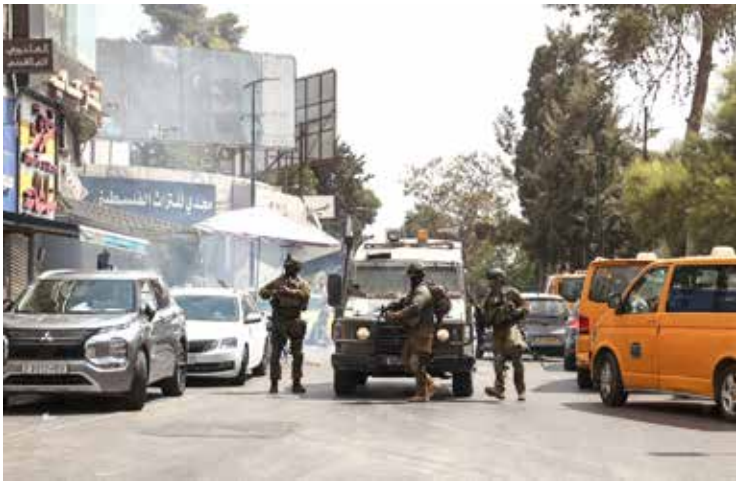
Israeli soldiers block a road during a raid in the city of Ramallah, in the Israeli occupied West Bank

The Palestine Red Crescent Society said that the Israeli operation left at least 27 people wounded, eight of them by live fire, 14 by rubber bullets and five by shrapnel. Another 31 people were treated for tear-gas inhalation.