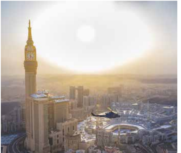
Air Force aircraft conduct aerial surveillance sorties over the Holy Precincts in Mecca to monitor crowd movement and population density, supporting field operations and strengthening civil defense emergency response efforts.