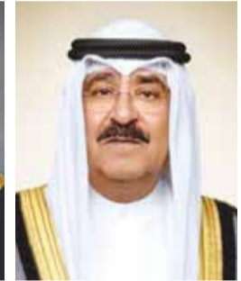
Kuwait's Emir Sheakh Meshal Al-Ahmad Al-Jaber Al-Sabah

the King exchanged warm Eid wishes with Egyptian President Abdel Fattah El-Sisi, Malaysian Sultan Ibrahim,