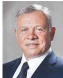
HM King Abdullah II of Jordan