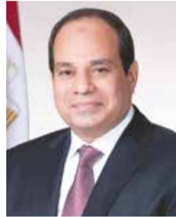
Egyptian President Abdel Fattah El-Sisi