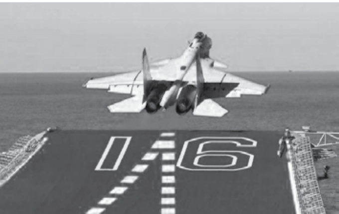
Chinese J-15 jets complete night landings on carrier in push to modernise

China has ambitious plans to overhaul its armed forces as it ramps up its presence in the disputed South China Sea and around self-ruled Taiwan, an island China considers its own. The official newspaper of the