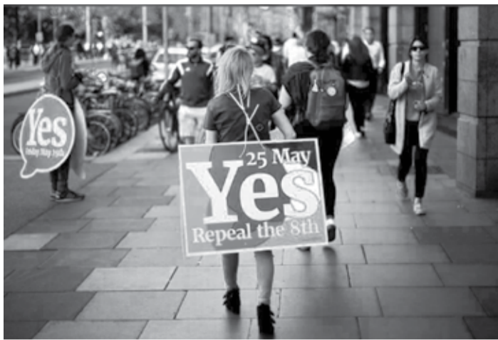
A woman carries a placard as Ireland holds a referendum on liberalising abortion laws

Ireland has voted by a landslide to liberalise some of the world's most restrictive abortion laws in what its prime minister described as the culmination of a "quiet revolution" in what was one of Europe's most socially conservative countries. Voters were estimated to have backed the change by more than two-to-one, according to two exit polls released on Friday evening, and the government plans to bring in legislation by the end of the year.