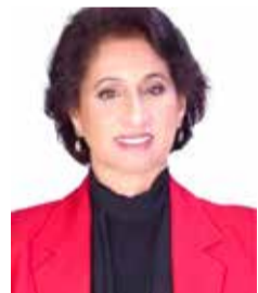
MP Eman Showaiter