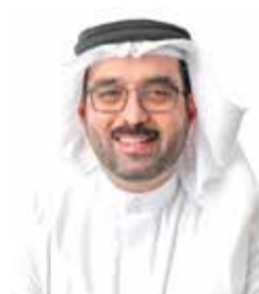
MP Ahmed Salloom