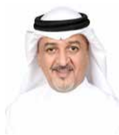
MP Jalal Kadhem