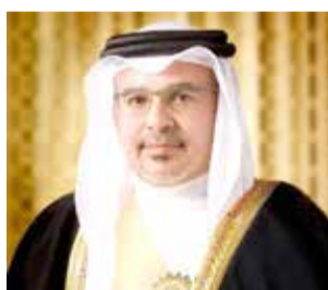
HRH Prince Salman