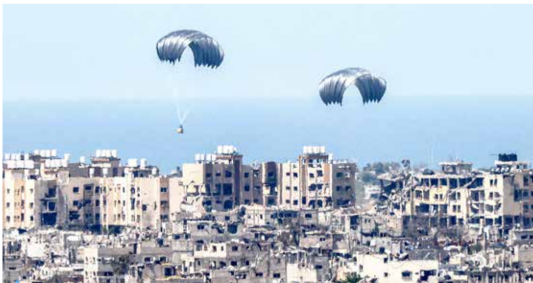
Parachutes of humanitarian aid dropping over Gaza.

The resolution also demands that Hamas fighters free the roughly 130 hostages Israel says remain in Gaza, including 33 captives who are presumed dead.