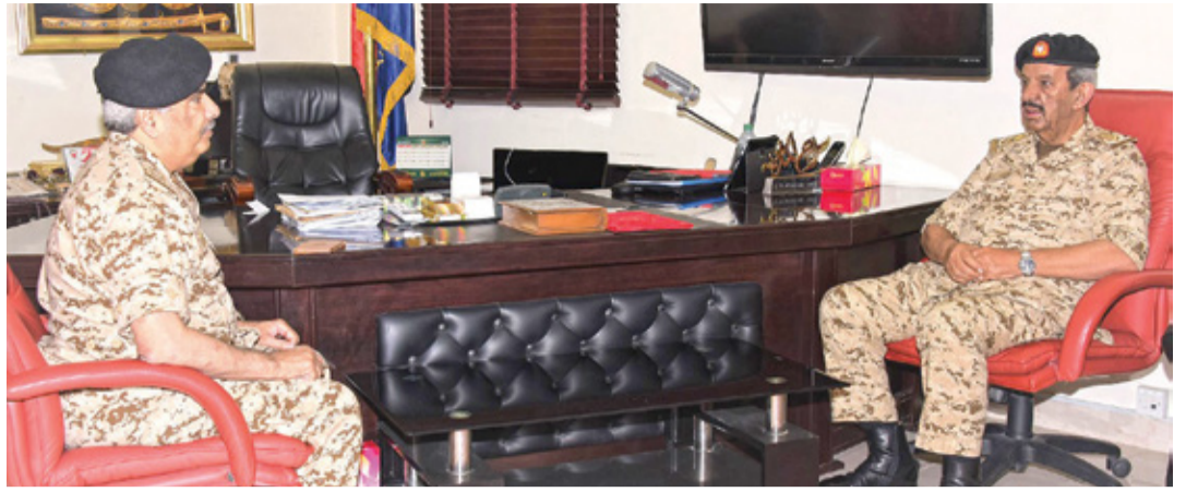
The BDF Commander-in-Chief, right, expects a BDF unit

He stressed the significance of maintaining its level of combat and administrative readiness and intensifying efforts in line with the vision of HM the King.