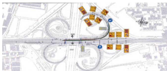
An illustration of the closed lanes

Road users are requested to observe and obey the traffic rules for the safety of all.