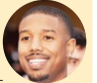
Michael B. Jordan

Actor Michael B. Jordan will produce and star in a