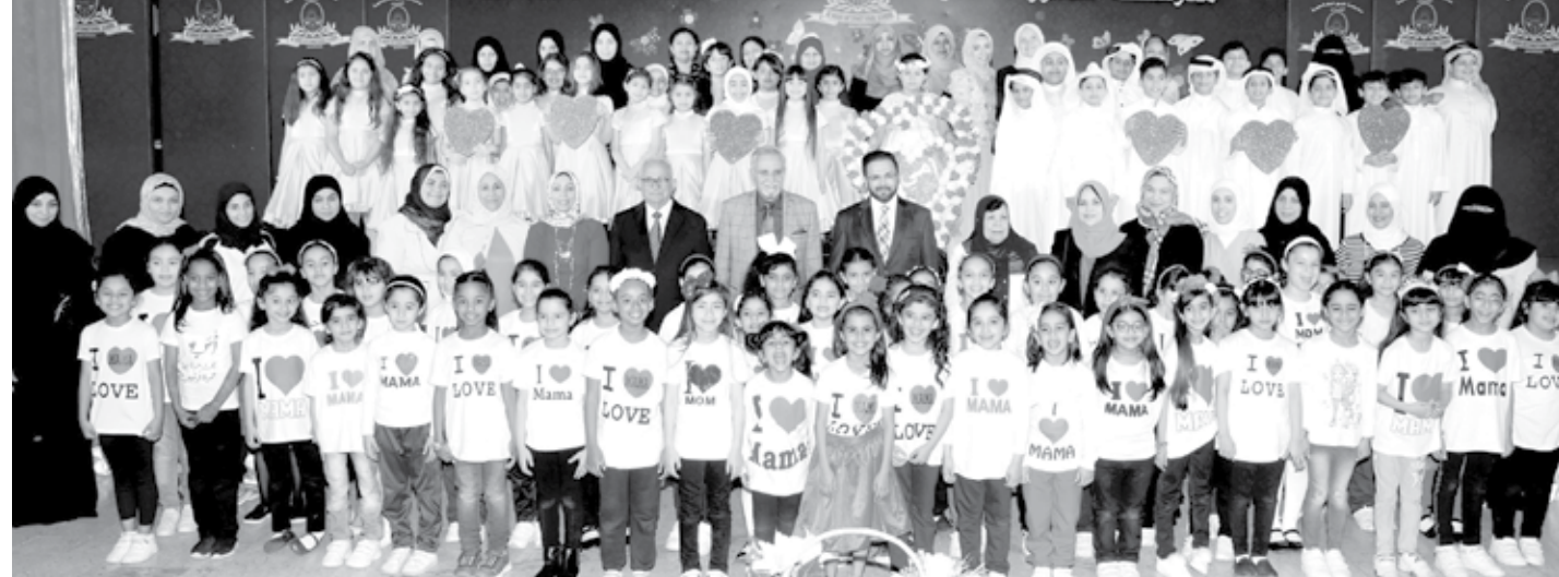
Al Noor International School students and staff during Mother's Day celebration

Heliwa delivered speech on the values in the family and socition the gifts were distributed present them to their mothers indication of marking their love importance of a mother's role ety. At the end of the celebrato students so that they would when they reach home with an and respect.