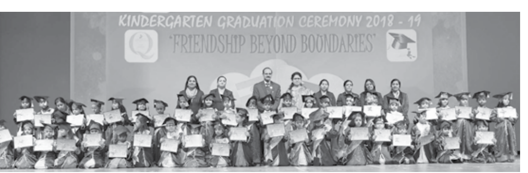
Kindergarten students of The New Millennium School with their certificates during the Graduation Ceremony

ed to receive their passing out year. The parents of the stu-school. certificates and medals from dents were present to witness Pre-Primary to Grade-1, in their the ceremony. blue gowns and caps.