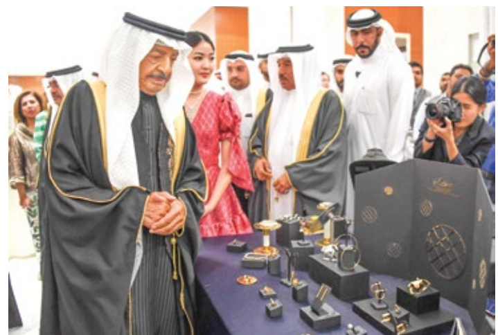
sor to the Thai Foreign Minister HRH the Premier tours Thai Culture and Food Festival.

HRH the Premier was received on arrive at the festival by Advi-