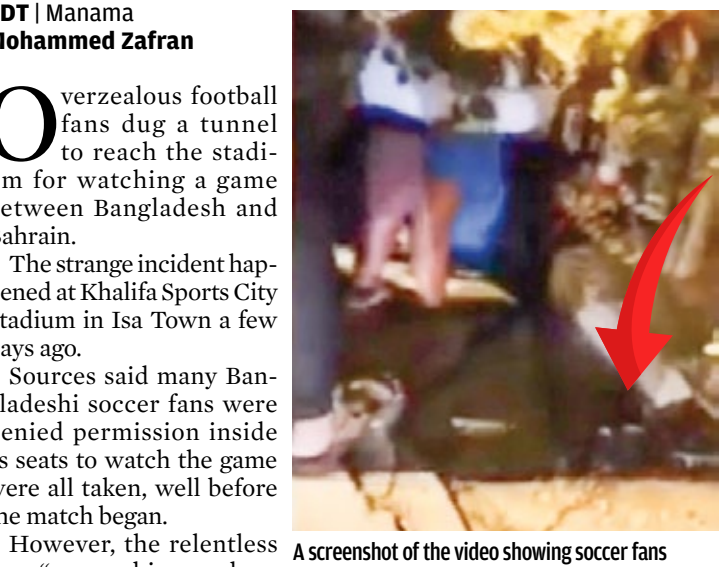
fans "engaged in an adven- digging a tunnel to make their way to the stadium.

Sources said many Bangladeshi soccer fans were denied permission inside as seats to watch the game were all taken, well before the match began.