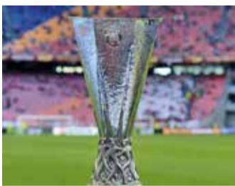
The Uefa Europa League trophy

Milan meanwhile have surrendered top spot in Serie A to neighbours Inter Milan after a run of three defeats in five league matches which has Ste-