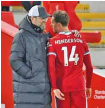
Jurgen Klopp and Jordan Henderson

The midfielder was forced off half an hour into a 2-0 home defeat to Everton last weekend and further investigation revealed the need for an operation.