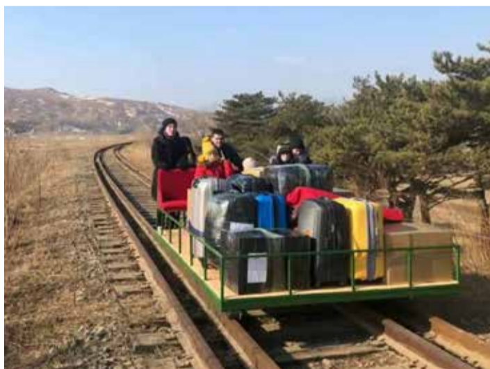
The Russian diplomats push the trolley on the train tracks

Sorokin was "the main 'engine' of the non-self-propelled railcar", it said, and had to push