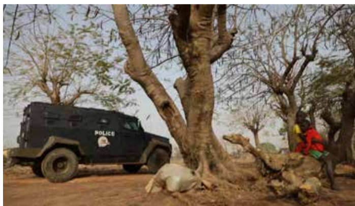
A police vehicle is seen near a college in Nigeria (file photo)

The abduction of at least 317 girls from school in Zamfara state