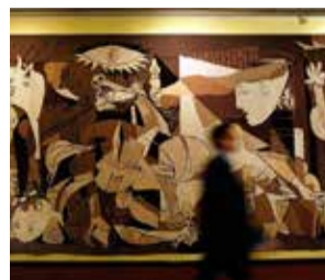
A man walks past the tapestry

A large tapestry depicting Pablo Picasso's fabled "Guernica" that hung outside the UN Security Council chamber for decades to remind diplomats of the risks of war has returned to its owner, Nelson Rockefeller, Jr., officials said.