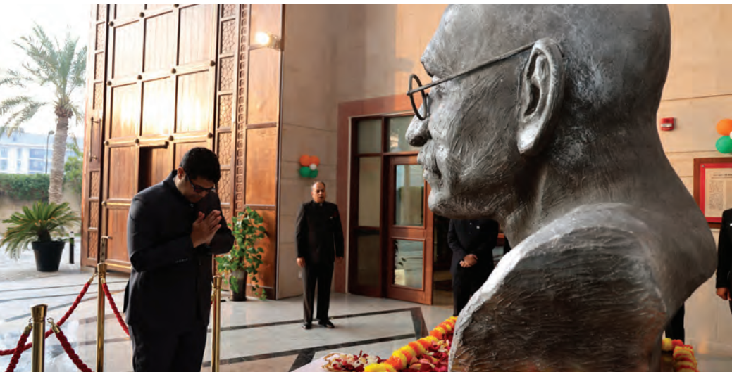
A floral tribute before the statue of the father of the nation, Mahatma Gandhi