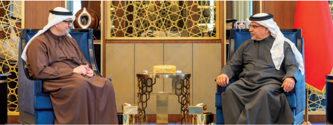
HRH the Crown Prince and Prime Minister with Mohamed Jameel Al Ramahi

"The Kingdom of Bahrain continues to adopt innovative renewable energy solutions that contribute to achieving our sustainable development goals, in line with the vision of His Majesty King Hamad bin Isa Al Khalifa," HRH Prince Salman said during a meeting with Mo-