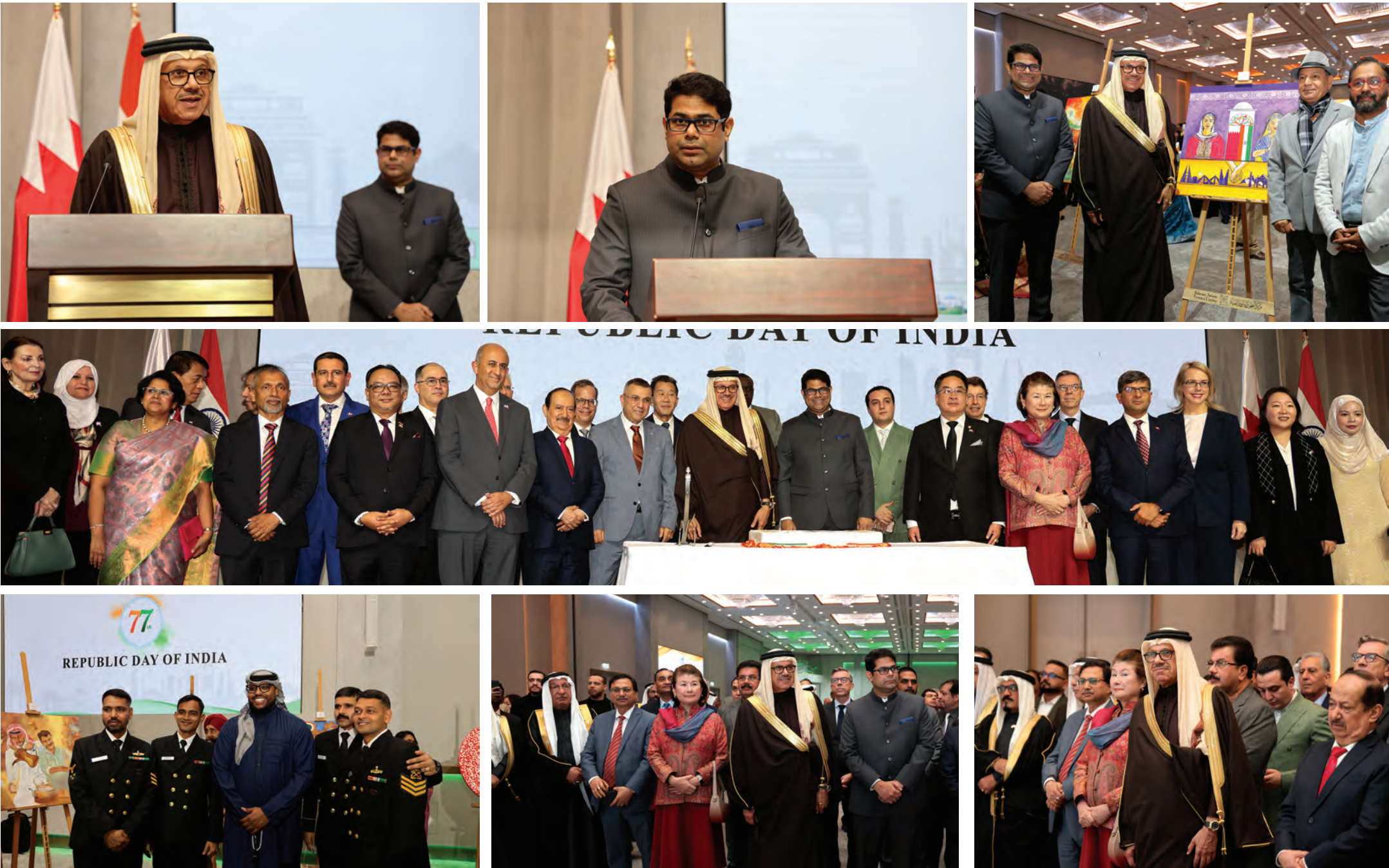
Rapper Hussam Aseem, better known by his stage name Flipperachi, poses with officials from the Embassy of India during the 77th Republic Day reception