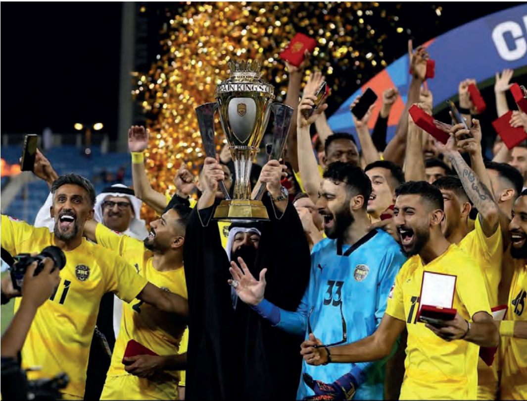
Al Khaldiya crowned King's Cup champions last season

The action opens at Shaikh Ali bin Mohammed Al Khalifa Stadium, where Bahrain Club take on Al Hidd at 4:35 PM, followed by Al Shabab facing Al Malkiya