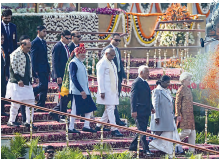
India's Prime Minister Narendra Modi, President of the European Council António Costa, President of the European Commission Ursula von der Leyen, India's President Droupadi Murmu and India's Defence Minister Rajnath Singh attend the country's 77th Republic Day parade at Kartavya Path in New Delhi

They had been working on a trade agreement for over a dec-