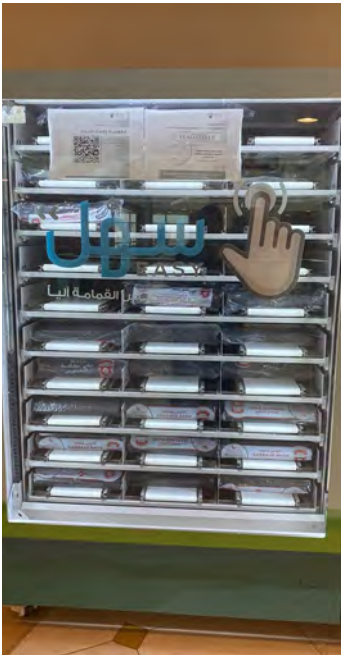
Waste bag machine