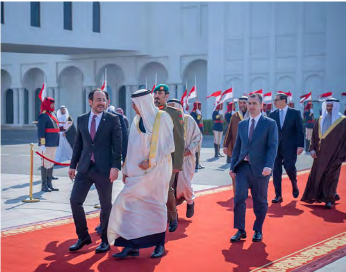
H.E. Cyprus President Nikos Christodoulides receives a warm farewell