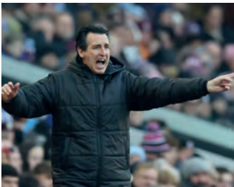
Unai Emery reacts during a match (file photo)

Villa moved within four points of leaders Arsenal with a 2-0 win at Newcastle, just hours before the Gunners crashed to a surprise 3-2 home defeat to resurgent Manchester United.