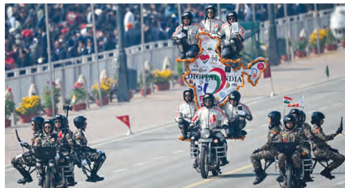
Indian soldiers perform a motorcycle stunt

figures, with a further 60 billion euros ($69 billion) in trade in services.