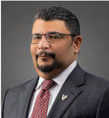
H.E. Yasser bin Ibrahim Humaidan

tricity and Water Affairs, as he noted that the Kingdom's efforts are ongoing to achieve ambitious visions that ensure a sustainable future for coming generations. Marking International Clean Energy Day, observed annually on January 26, he said the occasion highlights the importance of sustainability pathways and clean energy, in line with the Bahrain Economic Vision 2030 and the Sustainable Development Goals. The Minister explained that