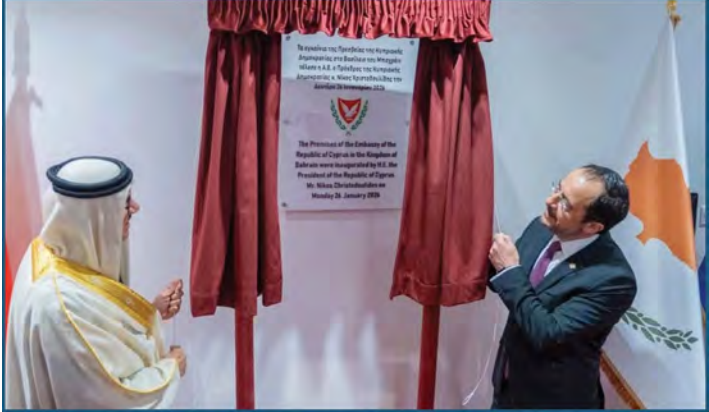
H.E. Dr. Abdullatif bin Rashid Al Zayani and H.E. Cyprus President Nikos Christodoulides at the embassy inauguration