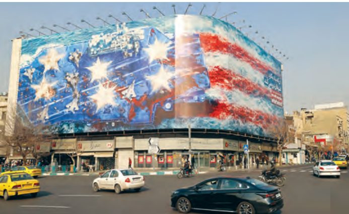
Cars drive past an anti-US billboard installed on a building at the Enqelab Square in Tehran

Abraham Lincoln carrier strike group dramatically boosts American firepower in the region.