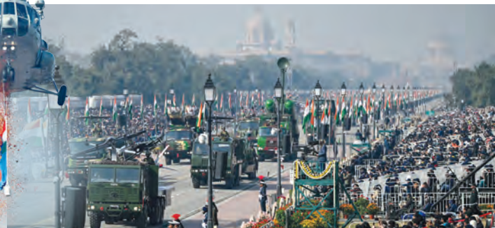
Indian military's armoured vehicles are pictured during the country's 77th Republic Day parade at Kartavya Path in New Delhi

Bilateral India-EU trade in goods reached 120 billion euros ($139 billion) in 2024, an increase of nearly 90 percent over the past decade, according to EU