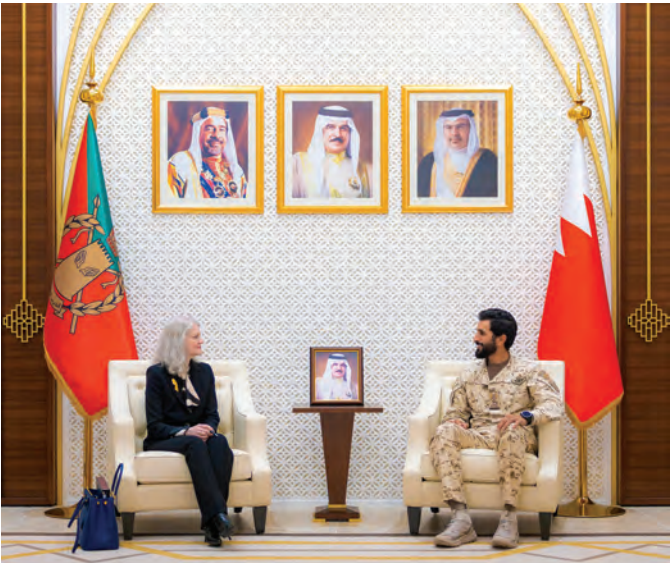
Lieutenant General His Highness Shaikh Nasser bin Hamad Al Khalifa, National Security Advisor, Royal Guard Commander and Secretary General of the Supreme Defence Council, received Allison Hooker, Under Secretary of State for Political Affairs of the US, and her accompanying delegation. The meeting was attended by His Excellency Shaikh Khalid bin Ali bin Jaber Al Khalifa, Deputy National Security Advisor and Deputy Secretary General of the Supreme Defence Council, and Stephanie Hallett, Ambassador of the US to the Kingdom of Bahrain. HH Shaikh Nasser underlined Bahrain's commitment to strengthen its strategic partnership with the US, emphasising that the existing cooperation between the two countries is essential to supporting regional security and stability.