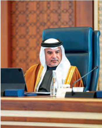
HRH Prince Salman chairs the weekly Cabinet meeting

Chaired by His Royal Highness Prince Salman bin Hamad Al Khalifa, the Crown Prince and Prime Minister, at Gudaibiya