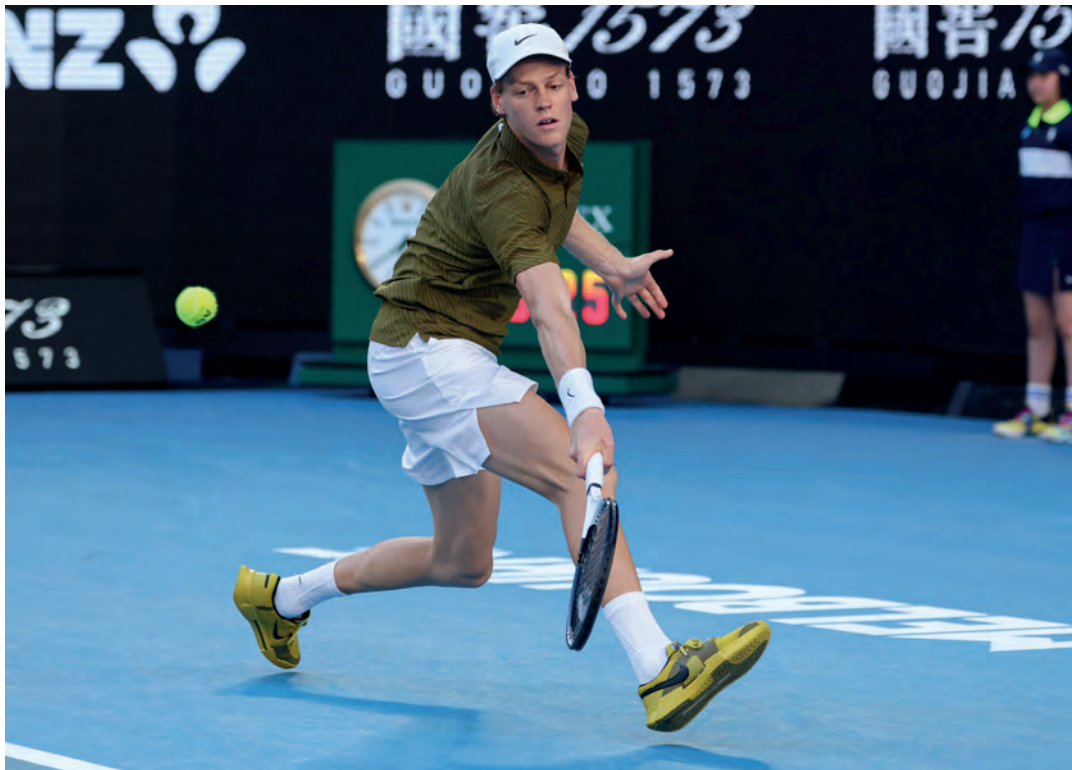
Italy’s Jannik Sinner hits a shot against Italy’s Luciano Darderi

Jannik Sinner sent an Australian Open statement in rolling into the quarter-finals yesterday but fellow champion Madison Keys was dethroned as Melbourne braced for forecast 45C heat. Fifth seed Lorenzo Musetti battled stifling conditions to set up a last-eight showdown with Novak Djokovic and six-time major champion Iga Swiatek progressed in rampant fashion. Two-time defending champion Sinner raced to a 6-1, 6-3, 7-6 (7/2) victory over fellow Italian and close friend Luciano Darderi. The second seed plays the United States’ all-action eighth seed Ben Shelton after he beat Norway’s 12th-seeded Casper Ruud in four sets. Djokovic and Sinner are on course for a blockbuster last-four showdown. Sinner told Margaret Court Arena, where temperatures hovered around 30C in the early evening: “It was difficult to put the match away, happy I closed it in three sets.” Sinner sent down a bumper 19 aces in the match, and said his