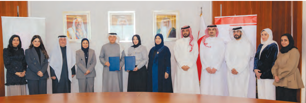
BENEFIT and Social Insurance Organization signed a memorandum of understanding on Monday to integrate and exchange data, streamlining financial procedures and speeding up transactions for private sector insured individuals and retirees.

in terms of organization and scientific content, in a manner that reflects the reputation of American Mission Hospital and achieves its scientific and professional objectives. The conference is expected to attract a distinguished group of physicians, consultants, and specialists in internal medicine from within and outside the Kingdom, with the committee set to announce full conference details in the coming period.